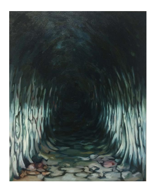
Figure 7: The Road Home, oil on canvas, 24"x30", 2015

Many of my landscape paintings are an invitation on an uncertain journey. The pathways I describe are often covered in branches and dark, but for some, it may seem alluring. This journey may lead to a haven or to danger, which one is either escaping or heading towards.