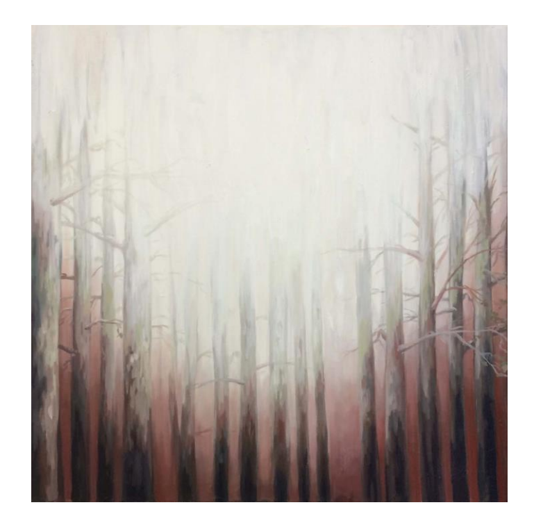
Figure 19: White Light, oil on canvas, 24"x24", 2016

Light is a symbol of the divine. The earliest humans worshipped sun and fire gods. Light is often associated with enlightenment and revelation, because it reveals the world around us. In my artwork, I use light as a symbol for a spiritual presence. I use it in small concentrated areas or I use it overbearingly to where the landscape is obliterated by either light or darkness. In White Light over half of the image has been taken over by a white light, as tree trunks, surrounded by a red glow, are aligned in the bottom portion.