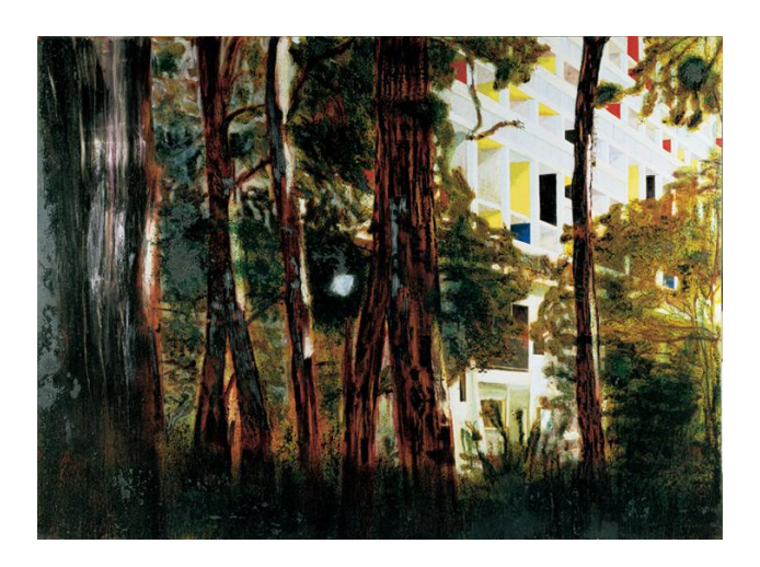
Figure 17: Peter Doig, Concrete Cabin, oil on canvas, 198 x 275cm,1994

Contemporary artist, Peter Doig, also investigates the human experience of the modern landscape. In Concrete Cabin he painted what seems like the fleeting moment of looking at a building through trees.