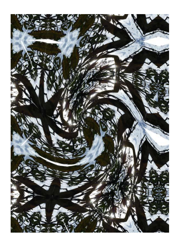
Figure. 4: Untitled