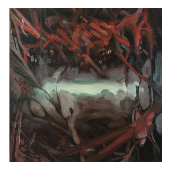
Figure. 1: Nightmare, oil on paper, 12"x12", 2015

The title for my Thesis exhibition, From Beyond , is borrowed from a short story by H.P. Lovecraft. In the story a man, through the help of a mad scientist, is briefly able to see into another dimension which contains monsters and ghosts, an experience that he carries with him for the rest of his life, to his horror. I chose to reference this story because my childhood home was haunted for a time. I had persistent nightmares. Years later, my mother told me about the incident, which allowed me to piece together something that had once happened. I thought I just had bad nightmares that would linger into the daytime. But once the notion of a haunting was introduced to me, some of the unexplained instances (of looming shadows, frightening visions, noises, and moving objects) started to assemble into a coherent order. The skeptic in me sometimes denies it, but there are a couple of very vivid memories that make me think, just maybe. In my oil painting Nightmare I painted what I imagine waking up from one of my nightmares look like.