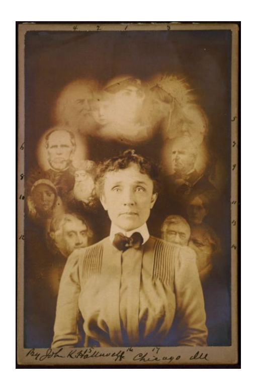
Figure 21: S.W. Fallis, Spirit, 1901

In the late 19<sup>th</sup> century the accidental discovery of double exposures opened a new market for photographers to trick people by inserting images of passed loved ones, as exemplified in S.W. Fallis's, "Spirit".<sup>24</sup>