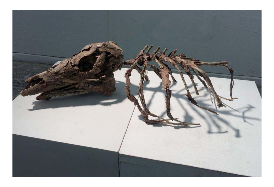
Figure 11: Zero, bark, twigs, and glue, 2016

Zero I collected the bark and branches that had fallen to the ground of the woods near my house and sculpted the remains of an unknown animal.