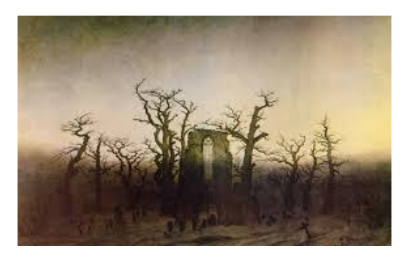
Figure 9: Caspar David Friedrich, Abbey In Oakwood , oil on canvas, 43.3"x67.3", Alte Nationalgalerie, Berlin, 1809

I would not describe my artworks as sublime because my artworks are not as epic and grand as those from the Romantic era. The wilderness in my artworks is not overbearing and can sometimes be inviting. The connection that I have with this era is that the wilderness is the subject matter and it has its own energy, often an ominous one. In Caspar David Friedrich's Abbey in Oakwood , he painted a bleak forest that contains a haze of light above.