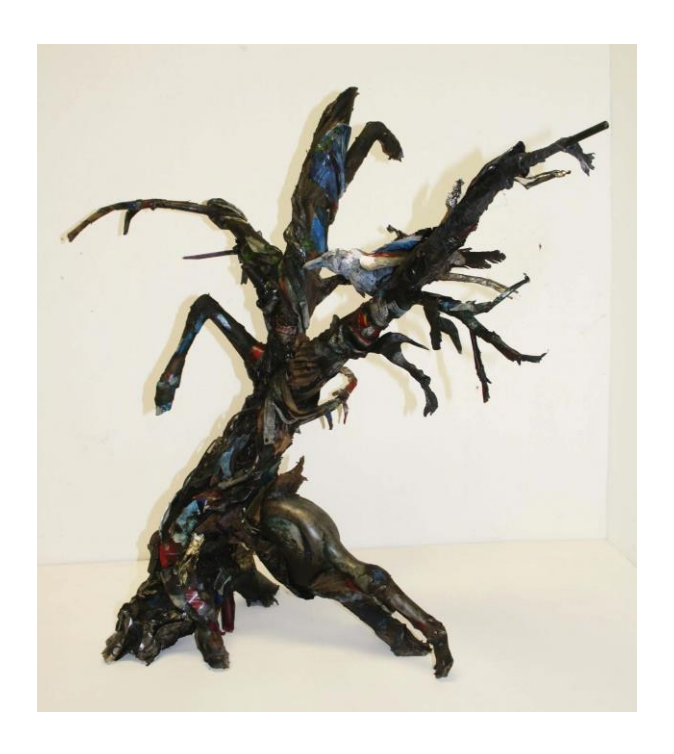
Figure 12: Tree of Life Incorporated, litter and acrylic, 30"x30", 2015

I removed the harmful plastics from the wilderness and created something seemingly organic. Those plastics represent the interruption of the natural symbiotic relationship of animals and plants. I had considered continuing to create sculptures like this one, but I felt that it was disconnected from my paintings because it was too literal, whereas my paintings had become more ambiguous. The biggest inspiration I took from creating this work was the process of collecting materials. The inspiration for all of my artworks come from the same places around my home and now even the materials come from them.