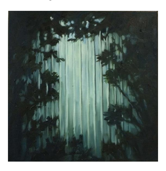
Figure 18: Industrial Park, oil on canvas, 12"x12", 2016

The foreground is covered by trees, who's organic lines greatly contrast with the geometric building complex, which peaks out between their branches. This contrast between man-made and organic is seen in my painting, Industrial Park , where trees create a vignette around the image, surrounding the center, that contains the metal siding of a building. My visual articulation of man-made inventions revolve around light.