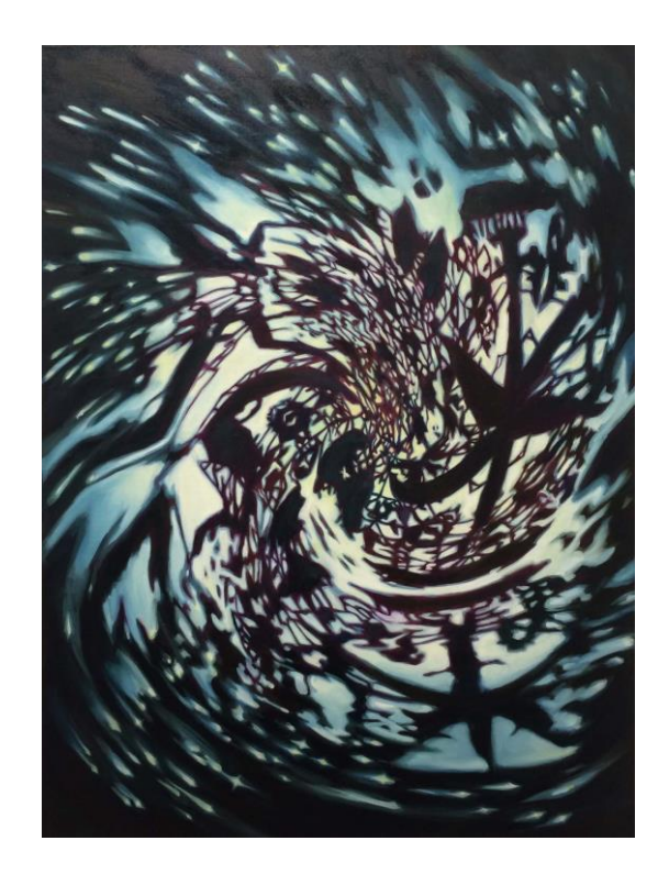
Figure. 3: Astral, oil on canvas, 48"x 36", 2015