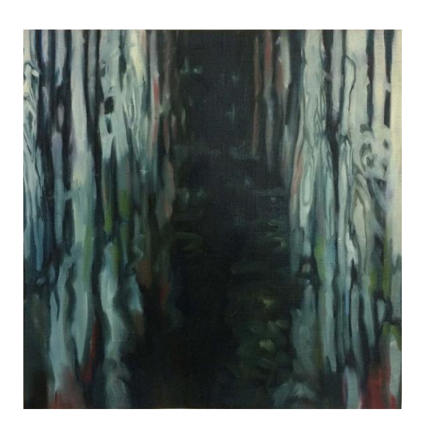
Figure. 2: Coyote, oil on paper, 12"x12", 2015

The ominous, is the feeling that something harmful is lurking. I have always found a kindred spirit in the author H.P. Lovecraft. He shares my love for the forest. He wrote, "Close by my home there lies a singular wooded hollow in whose twilight deeps I spent most of my time; reading, thinking, and dreaming." His writing is incredibly poetic and often takes the reader on a dangerous journey. H.P. Lovecraft is famous for his creation of the "cosmic horror" in which he describes ominous forces and creatures that lurk just out of sight. The sinister aspect of my artwork is up for interpretation. I never visually articulate any potential threat other than shadows. I like to leave room for the viewer's imagination, as Lovecraft does. In Coyote (fig.2) I give the viewer a dark pathway, one that I imagine may contain an unseen threat, beyond the field of vision, waiting.