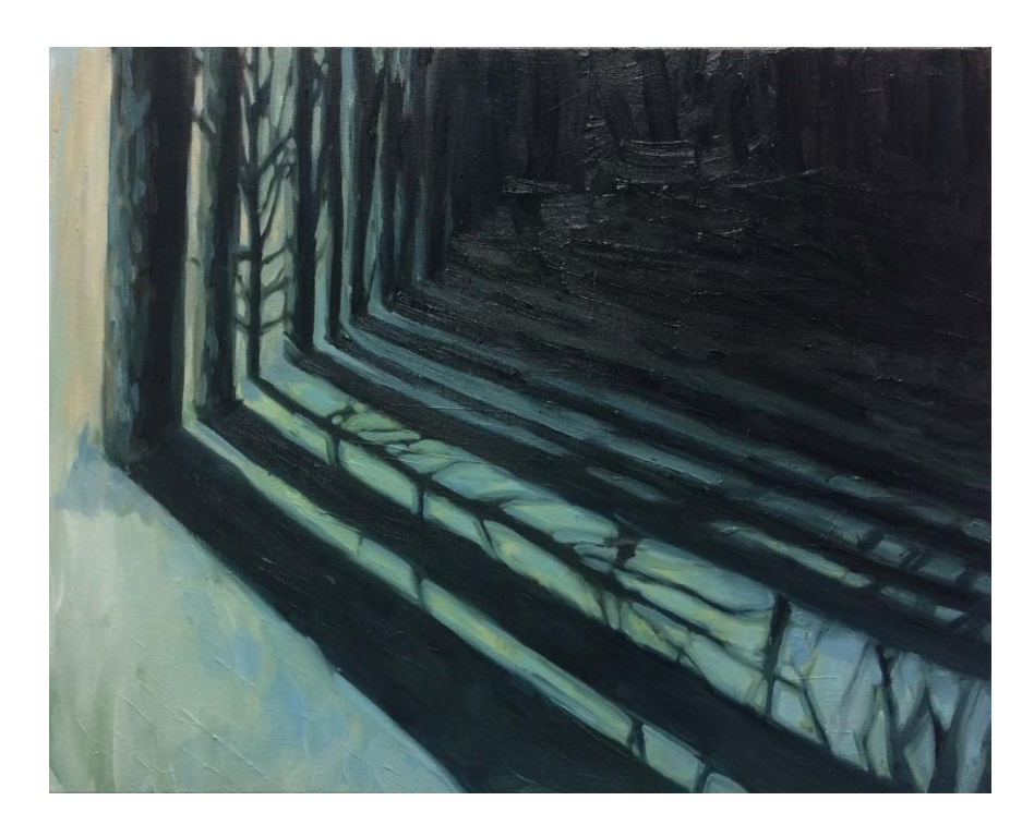
Figure 6: A Dark Path, oil on canvas, 20"x16", 2016

The foreground of this painting, where light shines through the trees, contains soft brushwork and as the eye recedes into the background, where more and more darkness fills the image, the brushwork becomes denser. The dense brushwork in the emptiness creates shapes and movement in an otherwise blank area. This creates more mystery in those spaces.