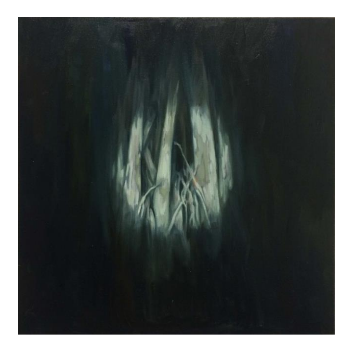
Figure 27: Spotlight, oil on canvas, 20"x20", 2016

The human footprint is obvious through the light source, yet the image still provokes an ominous expression, as if there is something more foreboding there than meets the eye. This photograph was inspired by an earlier painting I made, titled Spotlight , which recounted time I spent in the woods at dusk.