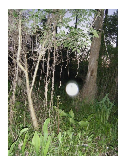
Figure 22: Orb, 2015

Today spirit orbs are one of the many occurrences attributed to capturing the supernatural on camera. Spirit orbs were introduced to me when a friend of mine showed me pictures of her trip to a famous haunted plantation. There were pictures of open fields and dusty interior spaces with orbs of light seemingly floating around, which she believed to be evidence of ghosts. In my photograph Orb I created a spirit orb by using a spray bottle and the flash of the camera.