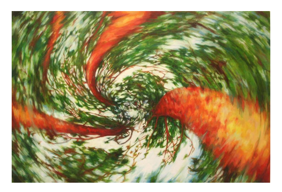
Figure 14: Whirlwind, oil on canvas, 36"x 24", 2015

In Gablik's writings she also stresses the need for humans to regularly connect with nature. She believes that modern people have lost touch with the wilderness and therefore, have lost their connection to myth.<sup>23</sup> When I first began the graduate program my artwork was primarily about the loss of connection between people and the natural landscape. I wanted to find a way to combine the modern world visually with the timelessness of the wilderness. In Whilrwind I painted from a photograph that I manipulated in Photoshop.