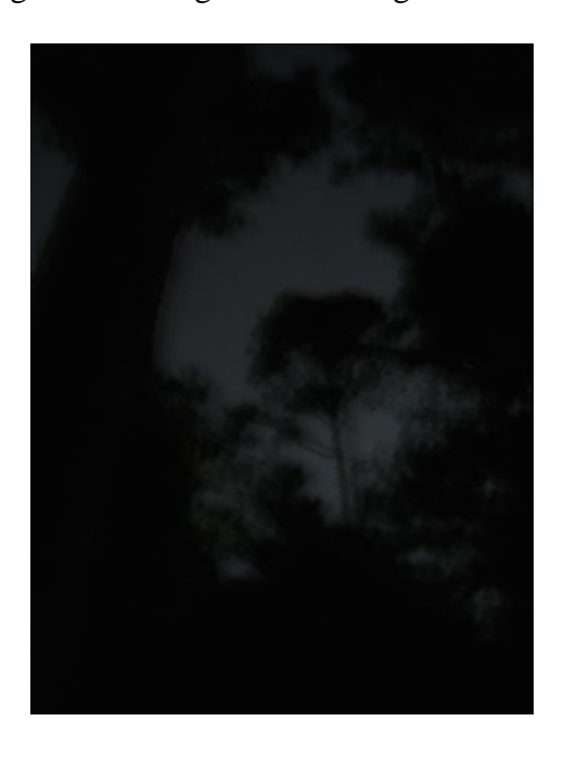
Figure 23: Dark Forest, 2016

Moving forward from this body of work, my photography has changed in the same way that my paintings have, I have let go of using blatant symbolism and focused on more subtle ways of communicating a spiritual presence within the wilderness. In Dark Forest the sky has almost turned black and a single tree is singled out amongst the others.