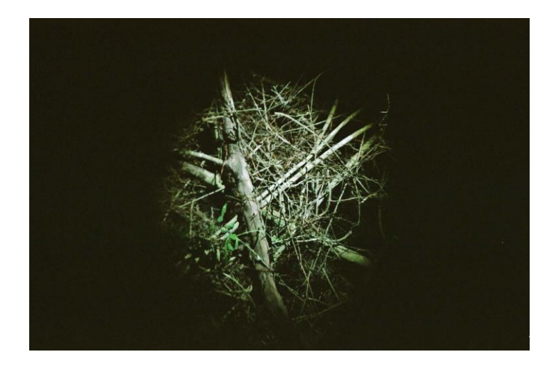
Figure 26: Forest Floor, 2016

My photography often informs my paintings and visa versa. In Forest Floor I used a flashlight centered on a pile of branches and vines.