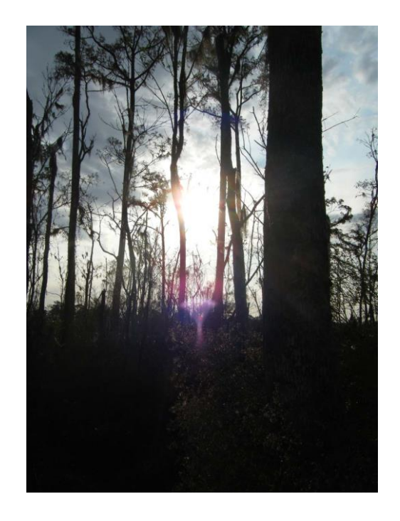
Figure 20: You're Not Alone Out Here, 2014

My photography also explores light. My initial intentions in using photography, were to capture moments of the landscape when time and place are lost to me. In You're Not Alone Out Here I captured a lovely moment when the sun was setting in the swamp.