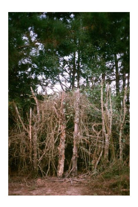
Figure 24: Stunted, 2016

There is a foreboding quality to the image as if one is being swallowed up, of trees and darkness. It reminds me of the dark forest in the fairytale Snow White, in which the trees are able to reach and claw at her. There is a threat of darkness in this image. For me, it represents life cycles because the space is in transition into darkness. In Stunted I also explore cycles.