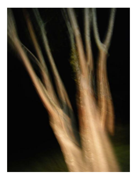
Figure 25: Limbs , 2015

photographed a small crepe and myrtle from a Chuck E Cheese parking lot, which was lit up by the headlights of my car.