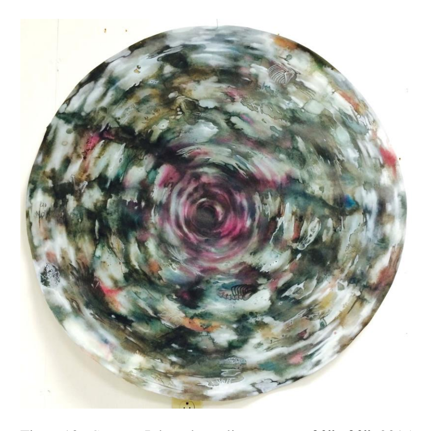
Figure 10: Cosmic, Ink and acrylic on paper, 30"x 30", 2015

The Romantic era was a time of scientific discovery when Naturalists were finding parallels among the animal, mineral, and vegetable kingdoms. This inquiry can also be found in my artworks, in the theme that I describe as the circle of life. In Cosmic , I used skeletal imagery of plants and animals in hopes to relate the connection of all living organisms.