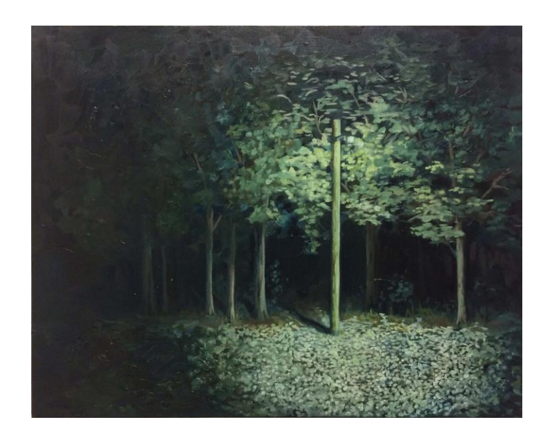
Figure 16: Edge of the Forest, oil on canvas, 24"x30", 2016

There is a wooden streetlight over a gravel road and behind is the forest. I have begun to incorporate more man made subjects, while still maintaining the wilderness as the subject. I am exploring the relationship that humans share with nature, and how the wilderness is not often pristine and untouched by modern inventions.