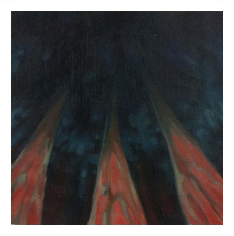
Figure 15: Red Light, oil on paper, 12"x12", 2015

Today my paintings, which explore the duality of natural and artificial, are inspired directly by my experiences. I especially take inspiration from the transitioning light of the evening time, when the sunlight is dying and artificial lights take its place. In some paintings the artificial is more subtle, while others portray it directly. The painting Red Light was inspired by a moment while stopped at a red light in which the trees were illuminated bright red.