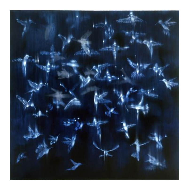
Figure. 5: Ross Bleckner, Birdland, oil on linen, 96' x 96', 2000

The idea of an unknown light interests me because light has long been an object of mystery the same way darkness has throughout history. Light and darkness can both obliterate vision, and doing so, leave the viewer in uncertainty.