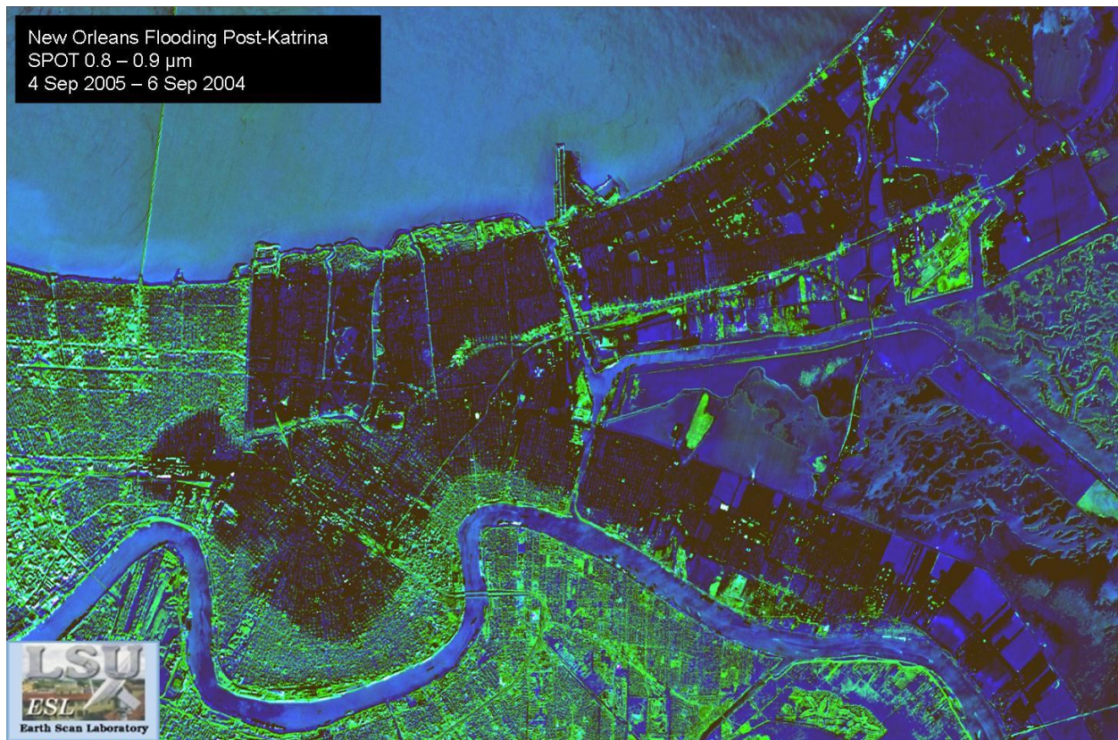
New Orleans Flooding Post-Katrina: Sept. 4, 2005

On August 29, 2005 Hurricane Katrina, the costliest disaster in US history, hit the Lower Mississippi River at Buras, LA. with a 22' storm surge. This wall of water virtually obliterated this small river town roughly 60 miles downriver of New Orleans while flooding 90% of Plaquemines Parish. Surges from the storm also caused horrific damage, destruction and death in New Orleans and surrounding parishes. Waters from the storm caused federal flood walls to fail (50 individual breaches) and levees to over top. In Louisiana, the magnitude of the storm affected hundreds of thousands of residents and caused billions of dollars of damage. Residents of New Orleans' East Bank were evacuees for months and in some cases years before returning to a forlorn and destitute shadow of their former city. Eighty percent of New Orleans was flooded. All municipal systems failed as did the communication network, which became a huge problem for all personnel engaged in disaster response. One-third of the Port of New Orleans was destroyed with over $100M in damages to facilities. Their tenant losses were estimated at $280 – $300 M (New Orleans port is getting over Katrina – New York Times 2006/01/03). Post-Katrina, city officials admitted that Emergency Response Plans in New Orleans were in name only. They were neither actionable nor implementable.