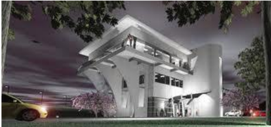
Baton Rouge MSOC

Hurricane Katrina also reinforced the importance of distant ports in overall disaster relief and response. The Port of Greater Baton Rouge, located roughly 100 miles upriver from New Orleans, became a hub of rescue and relief operations post-storm given its deep-water status and its connectivity to both highway and rail infrastructure. “The port was quickly inundated by diverted ships, residence ships and emergency supply ships. It became a staging area for emergency equipment, supplies, food, water and fuel being sent to the ports of New Orleans and St. Bernard and to Plaquemines Parish”. (Baton Rouge, LA. Boosts Interoperability with Regional Approach) Chandler Harris, 2008; Emergency)