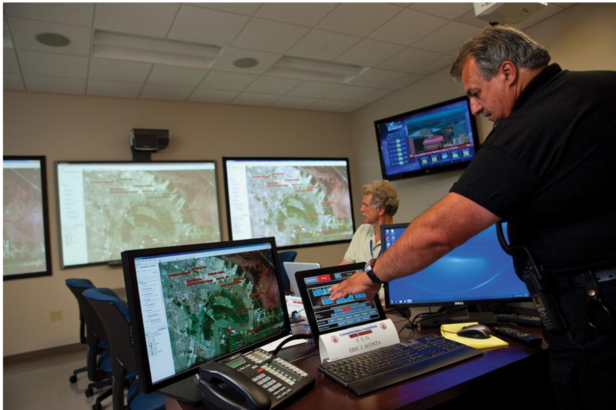
Maritime Security Operations Center

visitor identification, and self-protection responsibilities to ports and related facilities. It created Area Maritime Security Committees (AMSCs) that provide an industry/government mutual security framework under the direction of the (U.S. Coast Guard) Captain of the Port....During 2007 the five contiguous deep water ports of the Lower Mississippi River formed a consortium to compete for Port Security Grant Program funding as a region for the benefit of the entire state and river system by strengthening security for these core ports.” (PSSC White Paper, 2007) To date, PSSC has secured over $130M in PSGP grants for a wide array of equipment, computer hardware, software enhancements as well as training exercises.