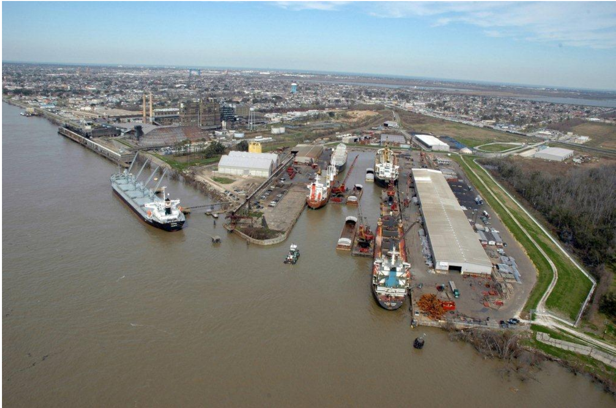
The Chalmette Slip: Normal Operations

Immediately after the winds subsided, maritime assets were used to save lives and begin the recovery of the City and the region. The Chalmette ferry and other vessels (198 total), safe harbored at the Port of St. Bernard's Chalmette Slip, transported thousands of residents to safety in Lower Algiers, an area of city on the West Bank, which did not flood. The "Cajun Navy", an all-volunteer flotilla from parishes west of the New Orleans, used recreational boats trailered to New Orleans to save more than one thousand stranded citizens post-Katrina.