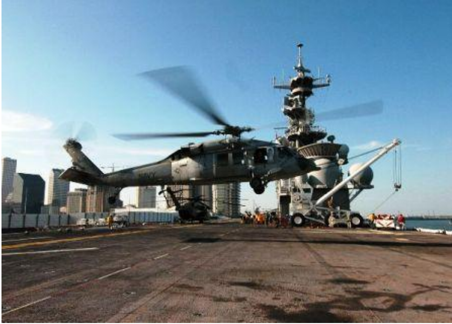
Military Support for Katrina Recovery on USS Iwo Jima

All available maritime assets were put to use after the storm: vessels (military, commercial, industrial); berths and slips; wharves and warehouses; the Port of New Orleans' (PONO) Administrative Building, fireboats, administrative and emergency response personnel; etc. This was dictated by necessity, not according to any disaster plan at any level of government. At the Port of St. Bernard, Associated Terminals' warehouse and office building were converted to Camp Katrina, a staging area for rescue operations, a safe haven for evacuees and an operations base for some first responders. Parish first responders used refineries as a base of operations.