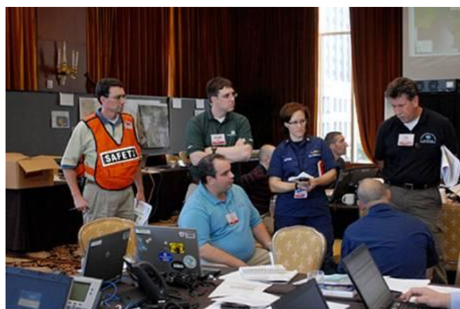
Marathon Petroleum Industry Led Exercise Hotel Intercontinental: April 12-14, 2011 New Orleans, LA