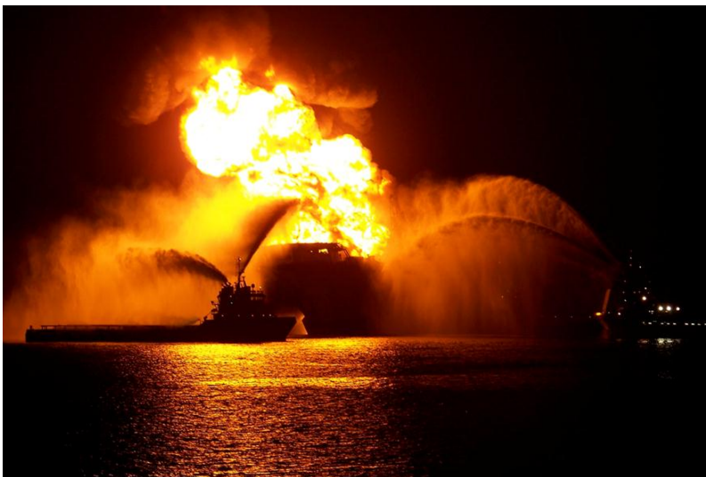
BP Deepwater Horizon Fire

On the evening of April 20, 2010, an explosion aboard British Petroleum's (BP) Deepwater Horizon off shore oil platform at the Macondo well resulted in the nation's largest oil spill. This monumental man-made disaster again required the mobilization of the region's and the Gulf Coast's maritime assets to avert an environmental catastrophe. These included vessels of all types, firefighting and oil spill personnel and equipment; response teams from the USCG and EPA; etc. In hindsight, it also highlighted both successes and failures in the nation's response to this manmade environmental disaster.