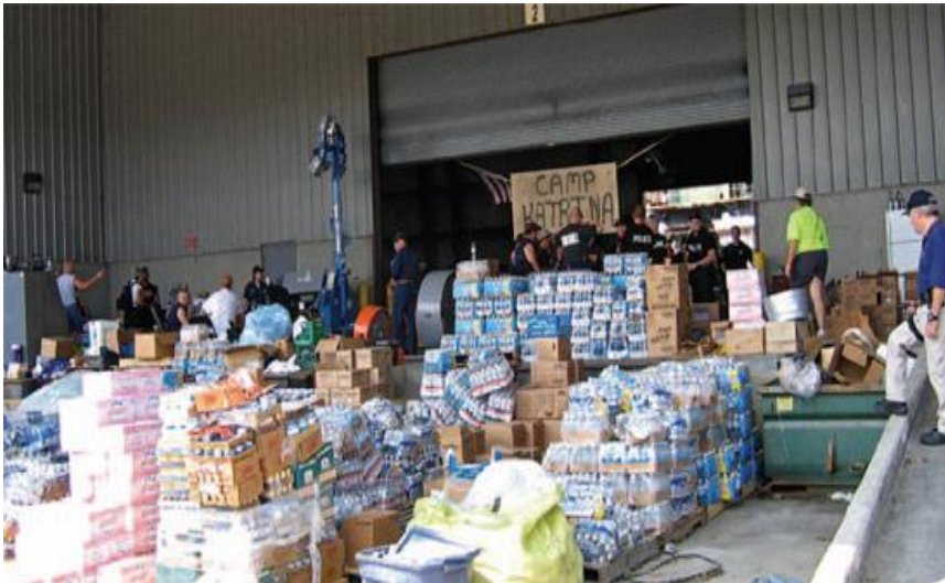
Camp Katrina, Port of St. Bernard

All available maritime assets were put to use after the storm: vessels (military, commercial, industrial); berths and slips; wharves and warehouses; the Port of New Orleans' (PONO) Administrative Building, fireboats, administrative and emergency response personnel; etc. This was dictated by necessity, not according to any disaster plan at any level of government. At the Port of St. Bernard, Associated Terminals' warehouse and office building were converted to Camp Katrina, a staging area for rescue operations, a safe haven for evacuees and an operations base for some first responders. Parish first responders used refineries as a base of operations.