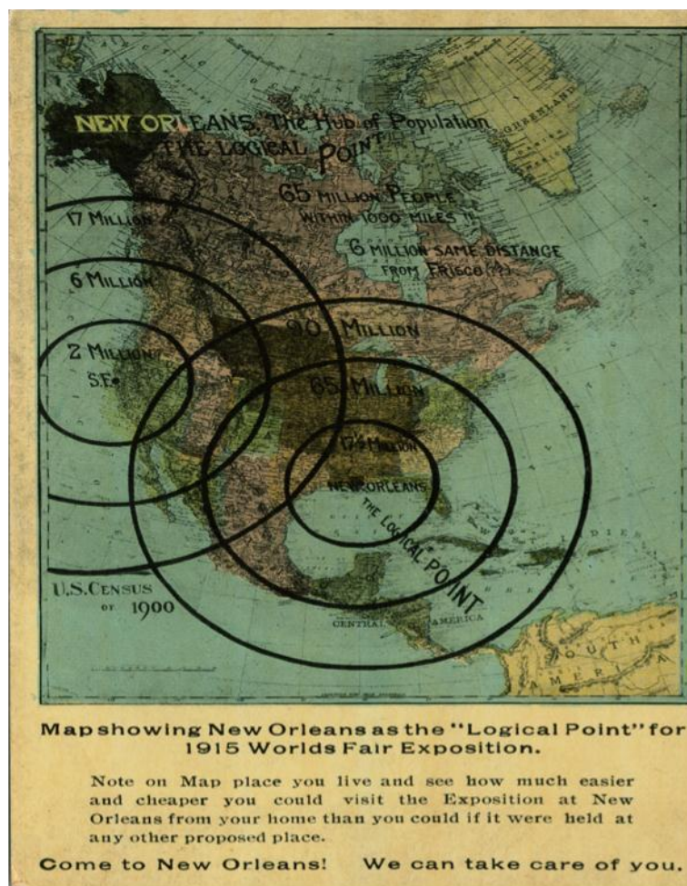
Figure 2. Map showing New Orleans as the “Logical Point” for 1915 World’s Fair Exposition. Picture from The Williams Research Center Historic New Orleans Collection.

population count within the radius from the respective points of interest. According to the postcard, it was clear that a densely populated area surrounded New Orleans, while San Francisco had little population in its vicinity. This postcard also carried an underlying tone of “southern hospitality.” On this card the phrase “we can take care of you” accompanied the “logical point” slogan. 45 In his 1911 speech before the House Committee on Industrial Arts and Expositions, Governor Sanders of Louisiana pleaded with Congress to grasp an understanding of New Orleans’ desire to entertain.