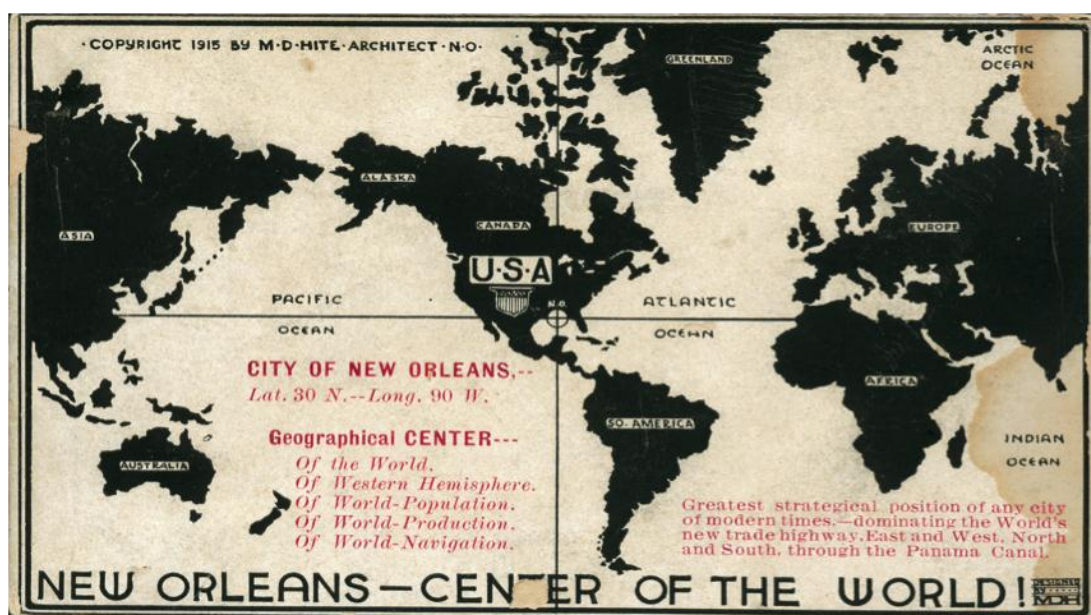
Figure 1. New Orleans—Center of the World!

the years 1910 to 1915 exemplified many of the arguments by boosters that New Orleans should be named host to the 1915 Panama Exposition. An illustrative card entitled, “New Orleans—Center of the World!” claimed that New Orleans was the geographic center of population, navigation, production, and the western hemisphere. 44 The card’s vignette showed the distance from New Orleans to Panama as shorter than the distance between San Francisco and Panama, thus making New Orleans the logical geographic location to host the celebration. The phrase “the logical point” became the slogan for New Orleans. New Orleanians pushed the geographic advantages of the city and its superior ability to entertain visitors en masse.