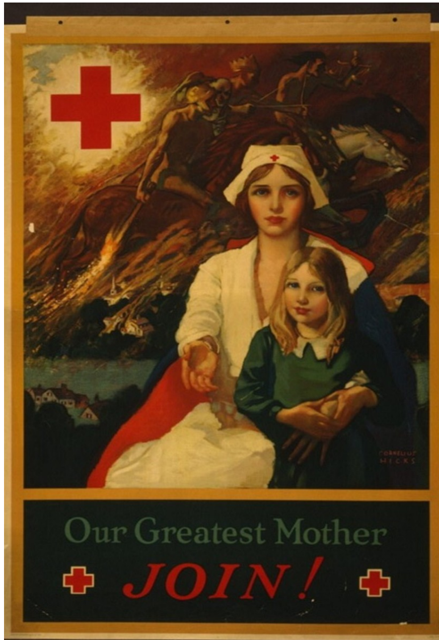
Figure 2. American Red Cross recruiting poster, circa 1917.

featured American Red Cross nurses tending wounded soldiers and war orphans that reiterated the role of women in helping professions while simultaneously performing a service for their country (see fig. 2).