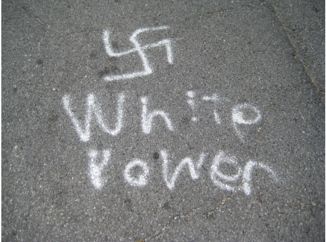
a.