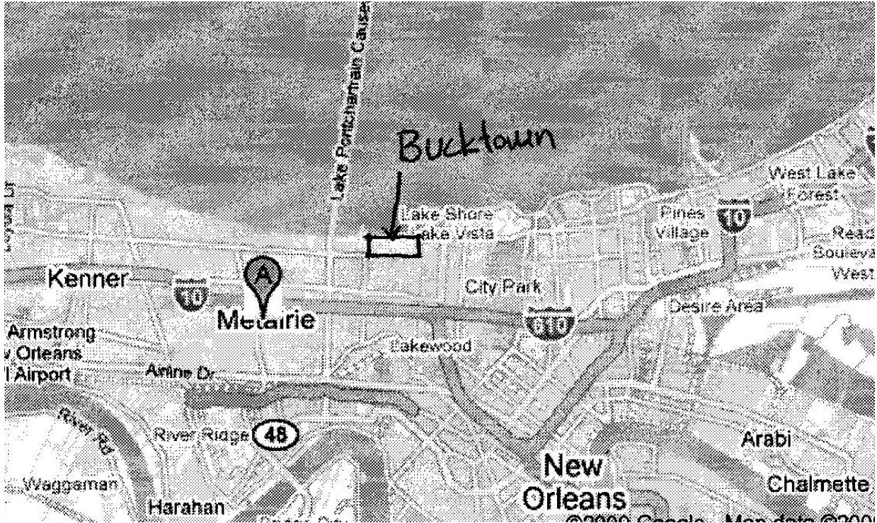
Figure 1: Map of Bucktown and surrounding area