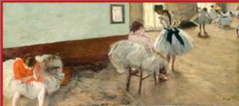
Degas, The Dance Lesson, 1879 National Gallery, Open Access Collection