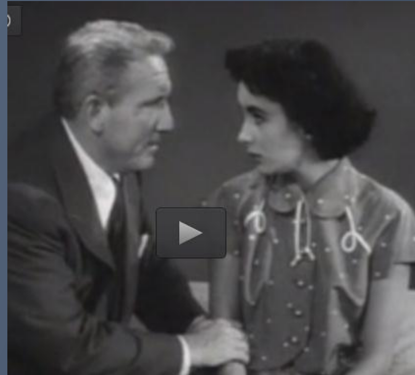
Father's Little Dividend, 1951, out of copyright