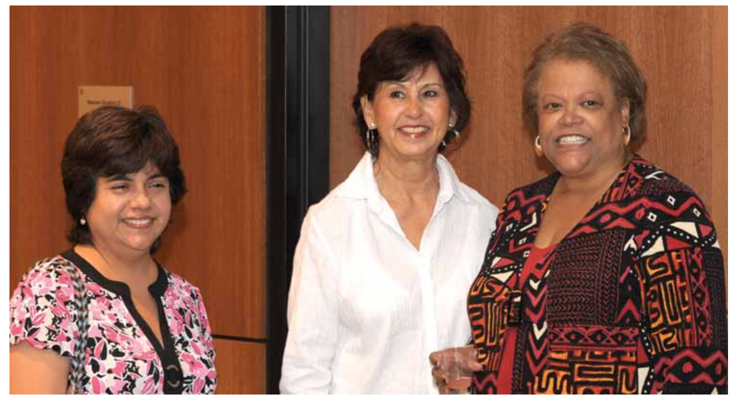
Published by ScholarSpace @ JCCC, 2009

I gained more than I can even begin to explain here.