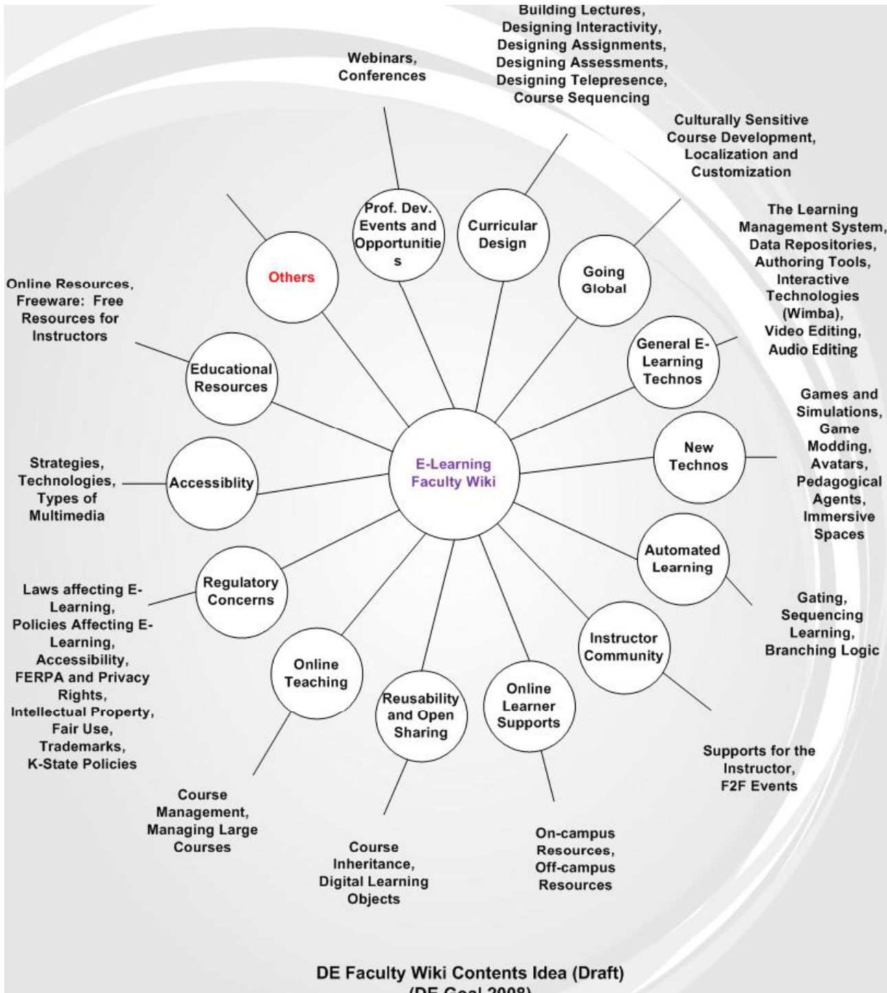
DE Faculty Wiki Contents Idea (Draft) (DE Goal 2008)