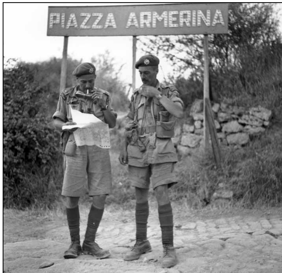
Library and Archives Canada (LAC) PA 132777

A similar situation occurred during the Sicily campaign with the casualty notifications hampered by the lack of a Second Echelon radio frequency. Additionally, mountainous terrain, poor quality batteries, and a lack of radio equipment due to the loss of supply ships meant that communications between Canadian units proved difficult, adding to casualty reporting delays. 21 This resulted in the inevitable informal revelations. The most conspicuous case, which the Conservative Globe and Mail attempted to turn into a government embarrassing cause célèbre , involved the family of Lieutenant-Colonel Ralph Crowe of the Royal Canadian Regiment, killed on 24 July. On 6 August several journalists asked the family for pictures of Crowe, explaining they wanted pictures of all members of the regiment. The family later learned that stories of Crowe's death began circulating at the local military district headquarters that