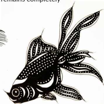
The Gold Fish Viktoria Tamas