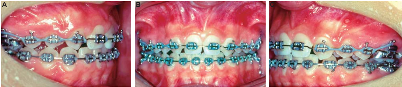
Figure 2- Treatment Progress: Intraoral (A-C) photographs showing full fixed appliances. Upper stainless steel arch performing bends (individualized canine extrusion) to adequate placement of gingival margins

Upper arch was aligning and leveling with continuous arches using Nitinol and also stainless steel arches to perform bending and torque. Individualized canine extrusion and first premolar intrusion during the mesial movement of these teeth were used. Finishing phase was accomplished with an stainless steel braided 0.019x0.025-inch