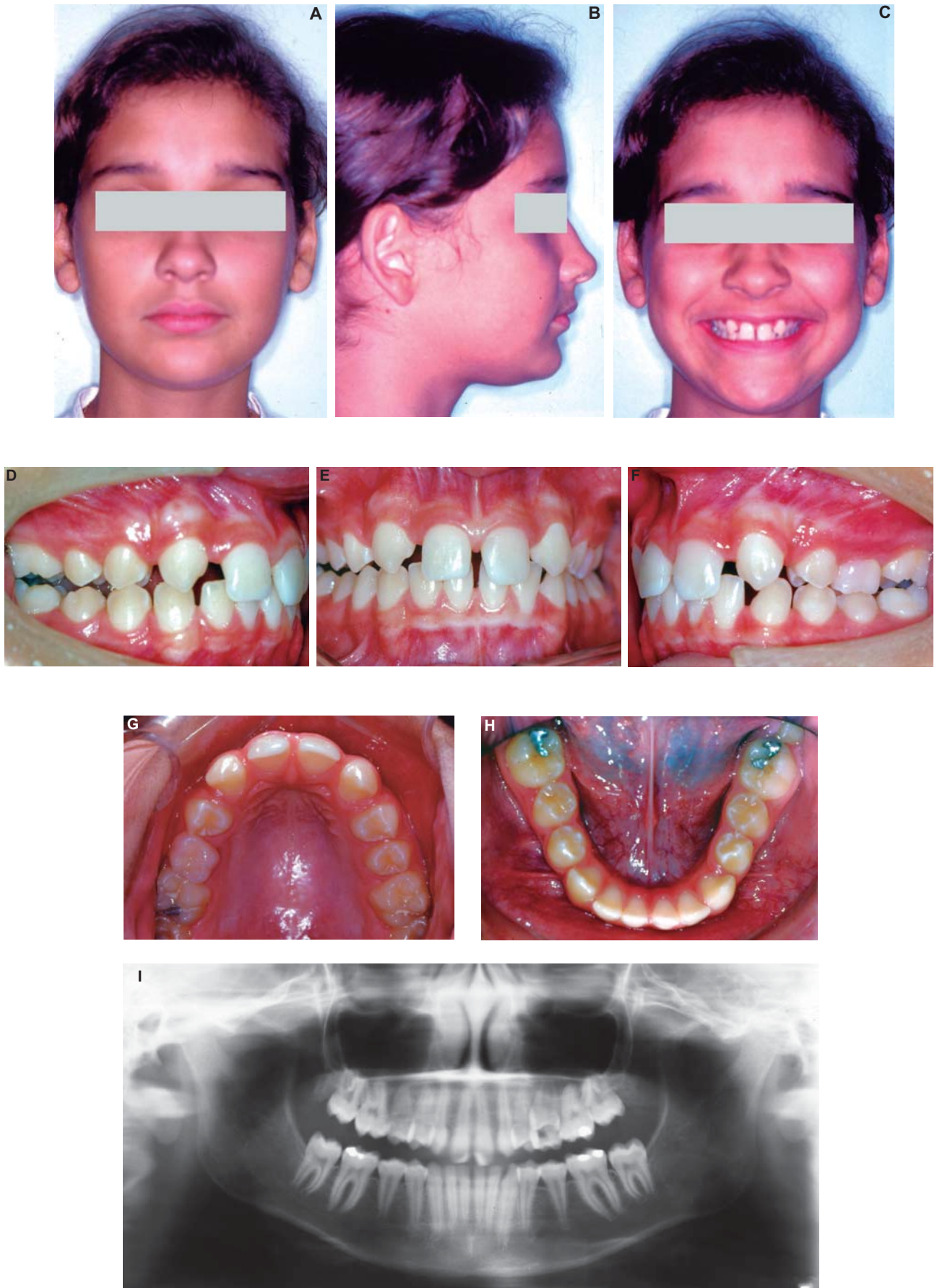
Figure 1- Pretreatment facial (A-C) and intraoral (D-H) photographs. Initial panoramic radiograph (I)