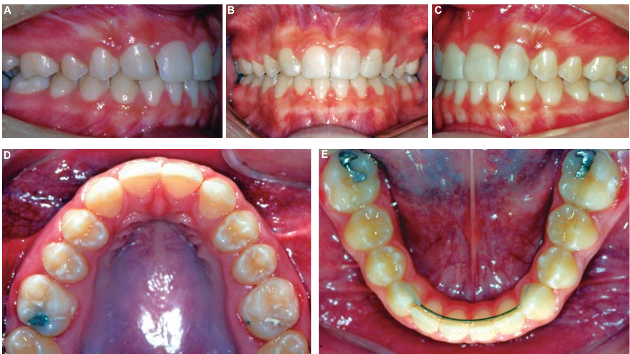
Figure 3- Post treatment intraoral (A-E) photographs showing proper crown torque of mesially relocated canines and premolars and an optimum level for the marginal gingival contours of the anterior teeth