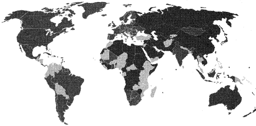
FIGURE 2 73