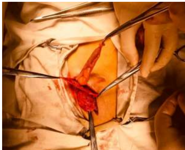
Figure 2. Vermiform appendix in the hernial sac

neither inflamed nor showed other signs of pathology. The intervention continued with herniorrhaphy (using the retro funicular procedure), followed by hernioplasty using the Lichtenstein tension-free mesh repair. The repair mesh was a composite polypropylene mesh.