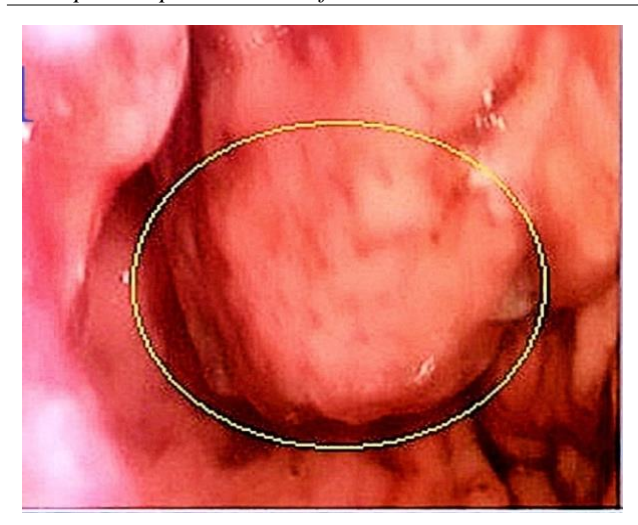
Figure 2. Small gastric GIST (circle) located between the mucosal folds of the stomach, identified through intraoperative endoscopy.