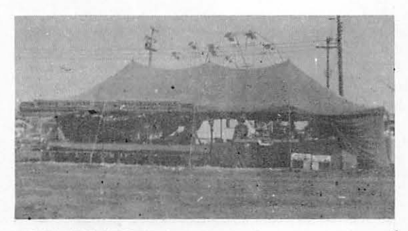
MEALS ARE SERVED in this tent by the members of the Monroe County Chapter during the annual County Fair in August.

Members of the Monroe Chapter, with the help of willing assistants, spent a busy week at the County Fair last August. The women served meals from 6:30 a.m. until midnight. The homemade pies were donated by members. A large sign "Monroe Chapter Valparaiso Guild" is placed across the front of the tent and can be seen from a great distance. The project means a great amount of work, but proves to be intensely interesting. It is also a service to the community and is greatly appreciated by County-fair Board members and the many who attend this annual event.