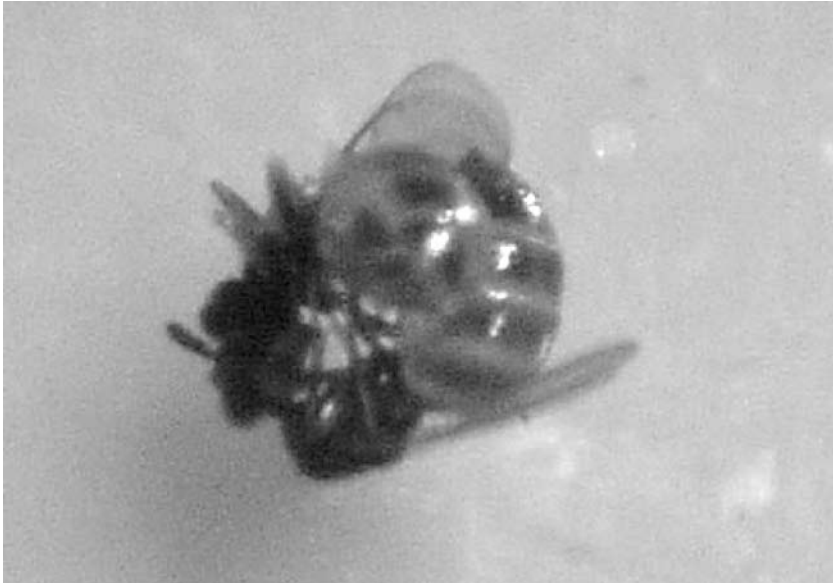
Fig. 2. Two egg-laden female M. femorata locked in combat. Although these encounters do not tend to be lethal, females often mutilate one another.