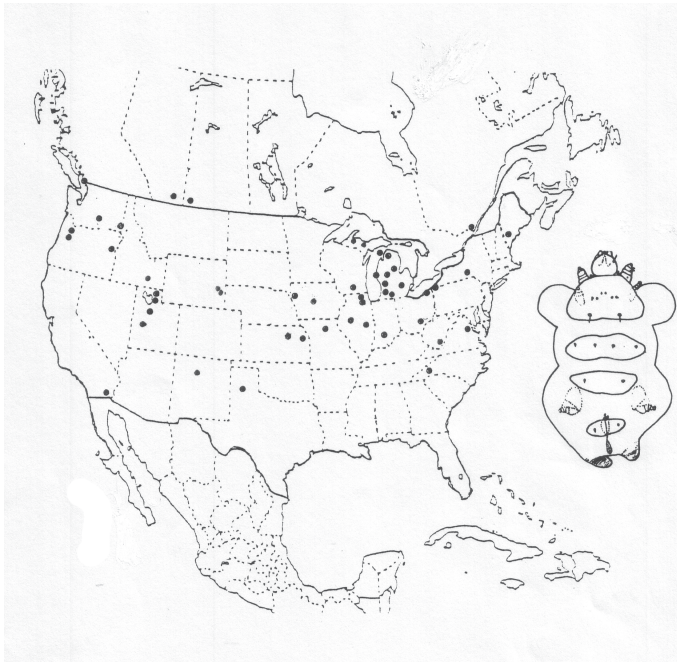
Figure 1. Distribution of Eutarsopolipus elzingai , a parasite of Stenolophus comma , S. lecontei , S. lineola and S. maculatus .

Characteristics of the three species of mites are discussed in Husband and Husband (2003, 2004). Figures of adult females are reproduced here with their distribution patterns in North America (Figs. 1-3). Specific records of localities in Michigan are found in Husband and Husband (2004).