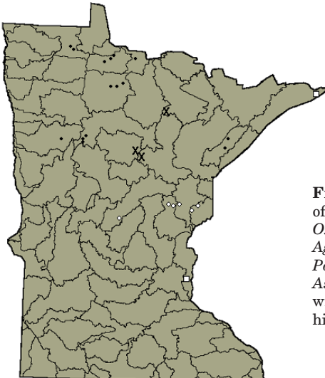
Figure 3. The known distributions of four rare caddisfly species: Oxyethira itascae (closed circles), Agapetus tomus (open circles), Polycentropus milaca (Xs), and Asynarchus rossi (open squares) within Minnesota based on all historical and recent collecting.

Asynarchus rossi (Leonard and Leonard) (Limnephilidae) adults were collected from Valley Creek, Washington County (N 44°55.07', W 92°48.37'), in October of 1996 (74 specimens) and in September of 1997 (11 specimens). An additional male was collected from Grand Portage Creek, Cook County (N 47°55.05', W 89°40.13'), in August of 2000. Although separated geographically,