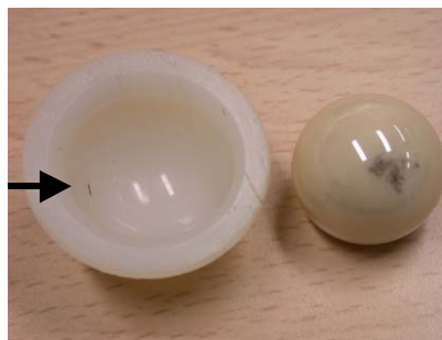
Fig. 1: Retrieved components related to clinical case A. The fibber is marked by a black arrow.

Whatever the diagnosis of revision (wear, osteolysis or broken multicable filament), it must be pointed out that polyethylene debris had been detected by histological analyses on periprosthetic tissues but that no loosening had occurred during lifetime. The four THR prostheses considered in this study were mainly retained because of the visual detection of metallic fibers embedded in the UHMWPE acetabular cups. Fig. 1 presents the retrieved articular components related to clinical case A and shows the presence of such a metallic fiber of millimetre size embedded into the surface of the UHMWPE acetabular cup but detected only after retrieval. Note also the adherent metallic deposit on the ceramic femoral head due to the friction of this counterface with the embedded fiber.