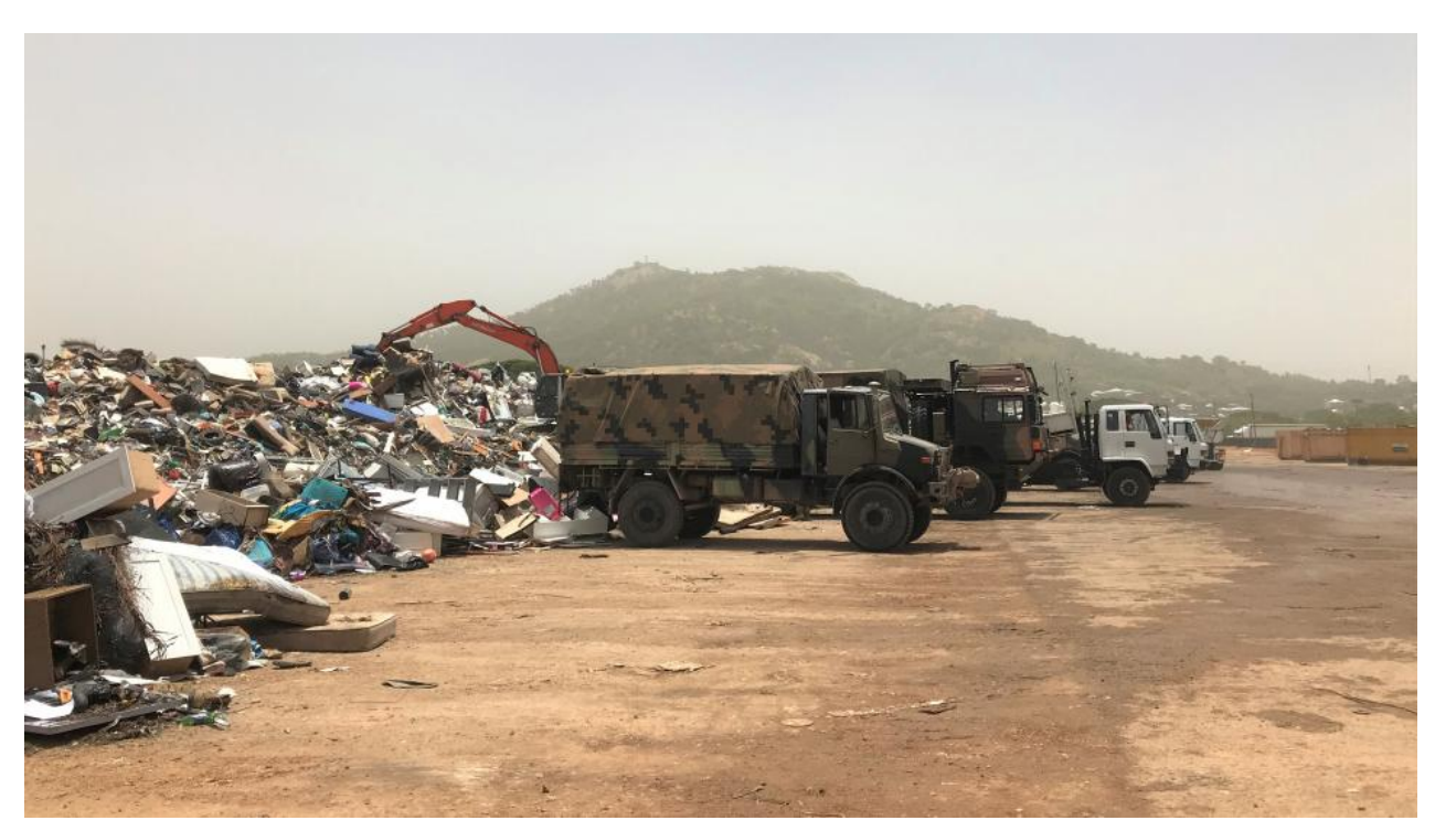
Photograph of army trucks clearing flood debris in Townsville, 2019. After the floodwaters had dried up, the Townsville City Council began clearing the mountains of flood debris with the assistance of the Australian Defence Force. This temporary dump site was located near the city center.

During the flooding of Townsville in January and February 2019, around two meters of rain fell within the Ross River catchment over fourteen days. The monumental deluge and subsequent catastrophic flooding gained international media attention after many homes were left uninhabitable and parts of the city became an urban archipelago. As the severity of the effects escalated, Townsville's community looked to the Queensland and Australian governments to manage the disaster and lead the recovery effort. In response, the Queensland state premier and the Australian federal prime minister visited the city to declare their support, and municipal authorities worked alongside emergency services, weather agencies, and the defense force to deliver critical information and to evacuate and shelter affected residents. Amid the chaos of flooding, there was a familiar sense of civic relief as the rain replenished the city's water supply. These concerns—abundance and scarcity—run through Townsville's water history.