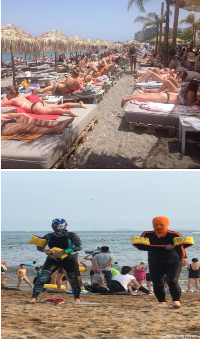
Figure 2. Contrasting European and Chinese Styles in the Sun