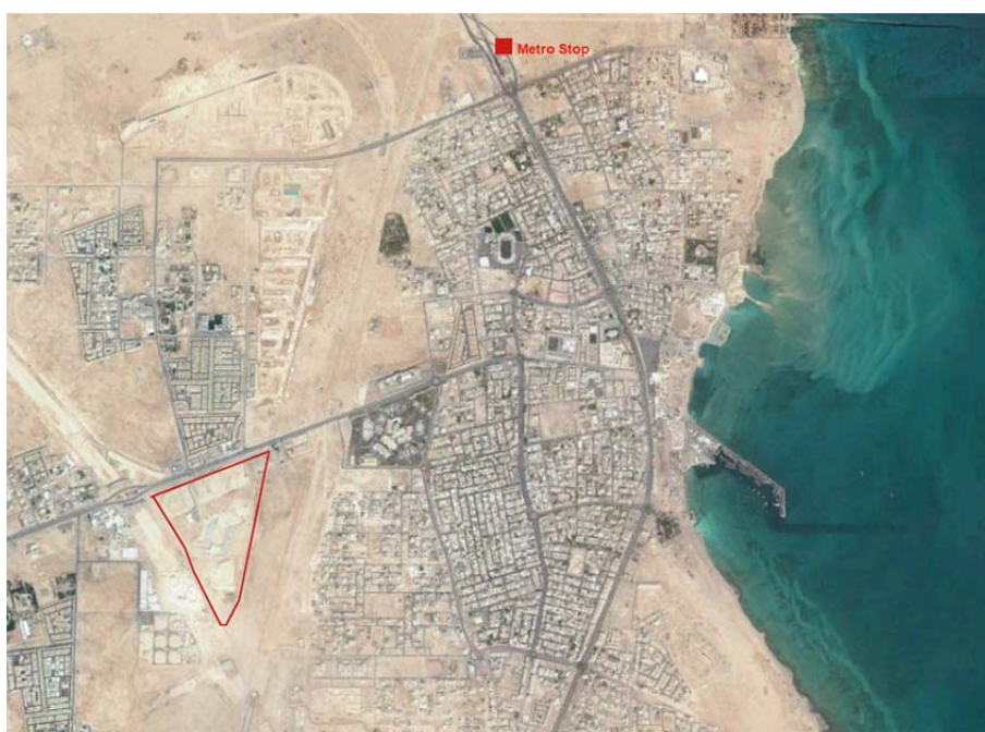
Figure 7. Aerial view of Al Wakrah, with metro stop and stadium's precincts.

The stadium is a new venue, around 7 km away from the metro stop on the red line (Figure 7). It stands near the main hospital and schools, and a mall. The capacity for the World Cup will be 40,000 seats, reduced to 20,000 in the legacy mode. According to the Supreme Committee of Delivery and Legacy (2016b), the upper tier will be disassembled and distributed to developing nations that lack sporting infrastructure. In the legacy mode, the venue will become the new home of Al Wakrah Sports Club.