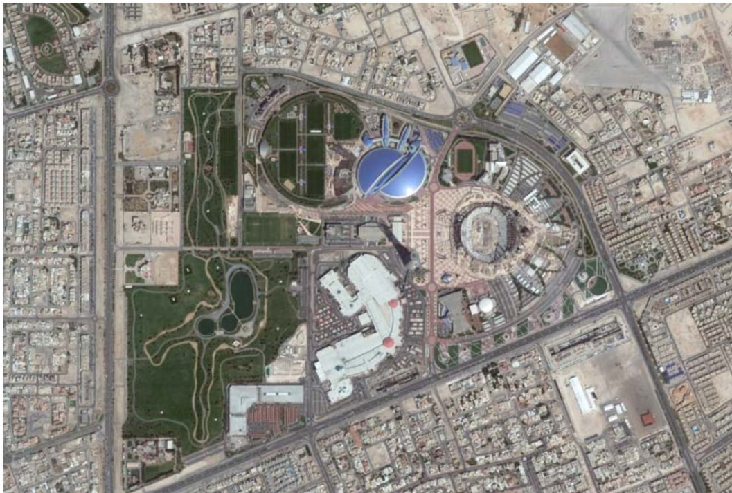
Figure 8. The facilities of the Aspire Zone.

The area will be served by the gold metro lines with the stops, Sports City and Al Aziziyah. The stadium, Khalifa International, has been recently upgraded to a capacity of 40,000 seats. The vocation of the area is to be the main sports hub of the city and to attract other large-scale sporting events to Qatar. Indeed, in September 2019, the stadium was the host venue for the 2019 IAAF World Athletics Championships.