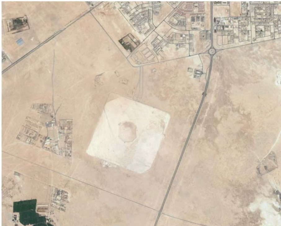
Figure 6. Aerial view of Al Khor stadium.

The new stadium will have a capacity of 60,000 seats, reduced to 38,000 in the legacy mode (Figures 6), and will host matches up to the semi-finals. The venue is planned to have a modular structure. In the bid book, its upper tier was presented to be made of removable seats, and, like a true nomad's tent, it will be 'portable'.