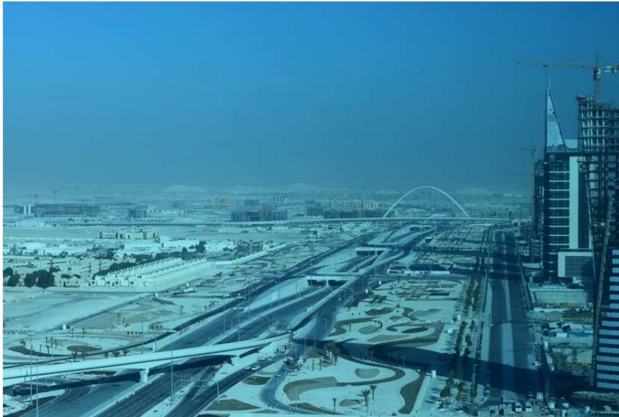
Figure 4. The area of Lusail under construction.

The stadium, built from scratch, will have a capacity of 80,000 and is set to host the opening and closing ceremonies as well as the final match. It is located in the middle of Lusail development (Figure 5).