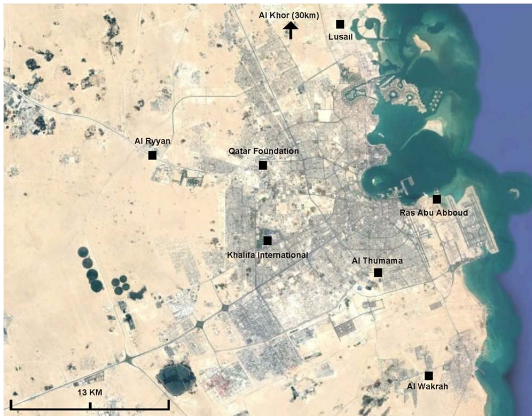
Figure 3. The location of the eight planned stadiums in Doha.

provided with cooling technologies that will be utilised all year-round, regardless of outside temperature and weather conditions.