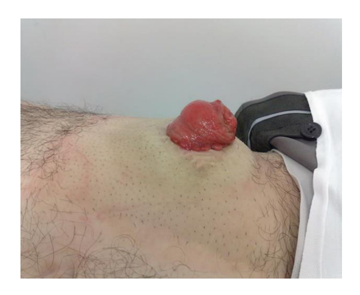
Figure 6 At 6 months' follow-up after laparoscopic parastomal hernia repair.

stoma application problems, or recurrences (Fig. 6). In particular, the skin redundancy over the mesh repair seen in the demonstration was asymptomatic, did not affect stoma management, and had improved further at the latest follow-up.