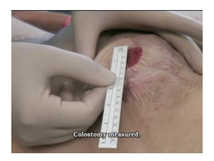
Figure 1 The parastomal hernia was measured. Mesh size was calculated.

We have used this technique in 3 patients with parastomal hernias after abdominoperineal resection for anorectal cancer. Abdominoperineal resection had been performed with a lower midline incision in 1 patient and laparoscopically in the other 2, all after neoadjuvant chemoradiotherapy. These were 2 men with a median age of 75 (range, 62–83) years. All parastomal hernias were located on one side of the stoma. A PROCEED (laminated oxidized regenerated cellulose fabric and polypropylene; Ethicon, Livingston, Scotland, UK) mesh was trimmed to cover the defect with 5 cm of overlap (Fig.1).