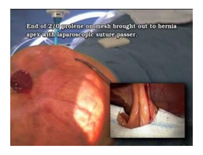
Figure 2 Mesh positioning using 2/0 Prolene brought out to the hernia apex.

abdominal wall naturally allowed the edges of the mesh slit to overlap adequately for securing with laparoscopic tacks (Fig.3). These steps are shown in the video (see Video, Supplemental Digital Content 1, <a href="http://links.lww.com/DCR/A40">http://links.lww.com/DCR/A40</a>).