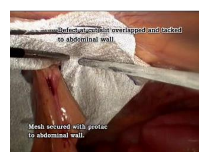
Figure 3 Laparoscopic tacks were used to secure the mesh to the abdominal wall.