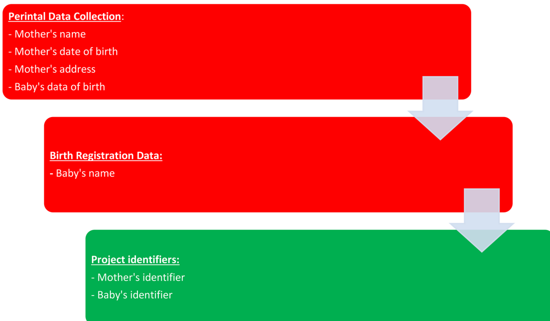
Figure 1 Variables used to identify cohort (shown in red), and identifiers provided to researchers (shown in green).

The SSB will provide the AIHW with the identifying variables and project identifiers shown in figure 1. The AIHW will then link MBS and PBS claim records from