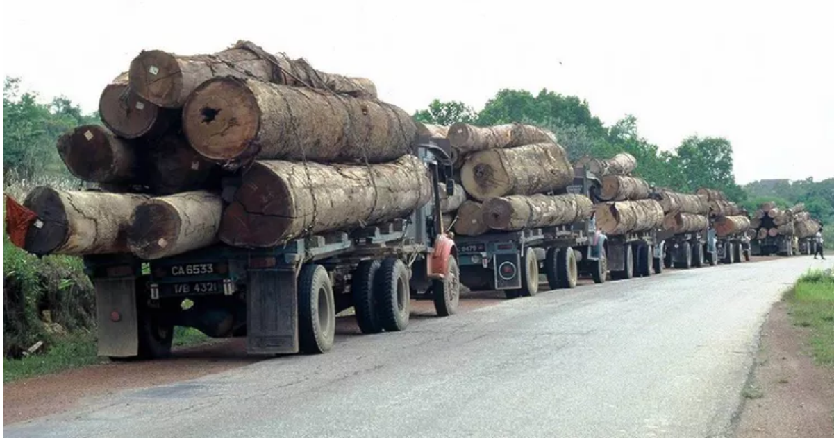
A queue of logging trucks in Southeast Asia. Jeff Vincent

China claims to be working to reduce its illegal timber imports, but its efforts are half-hearted at best, judging by the amount of illegal timber still flowing across its border with Myanmar.