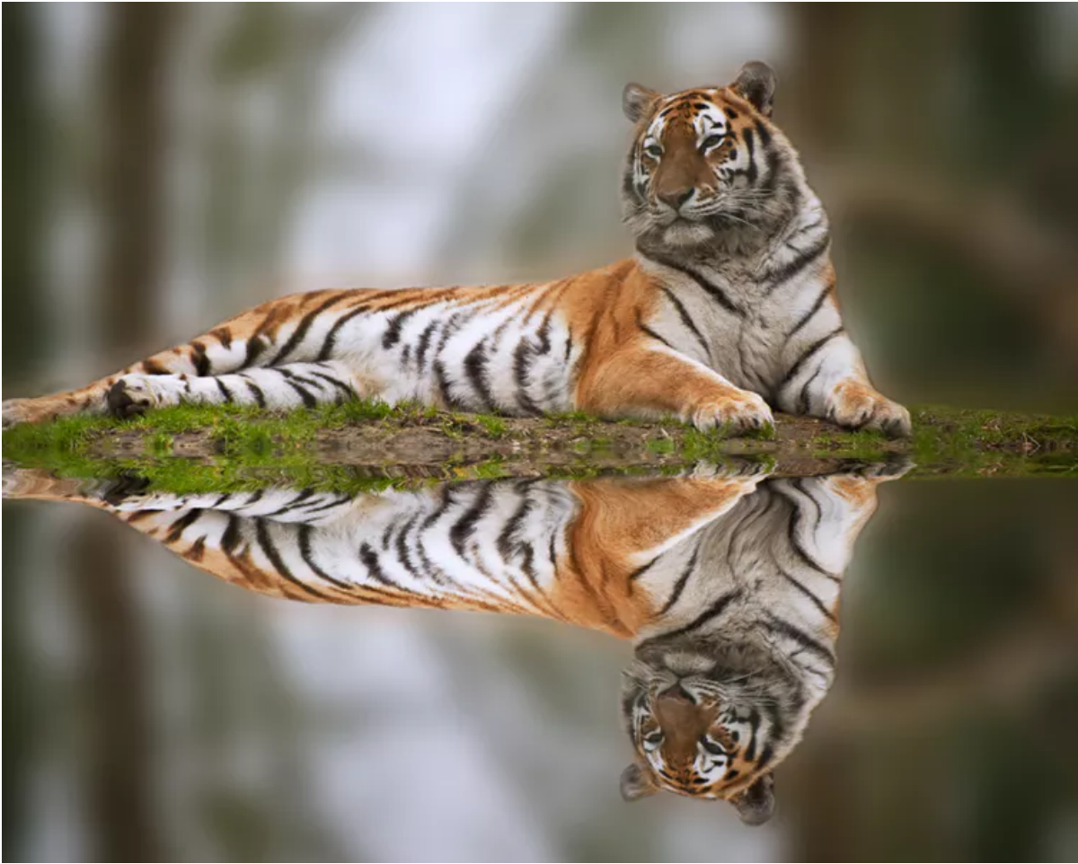
A tiger relaxes along a grassy bank.