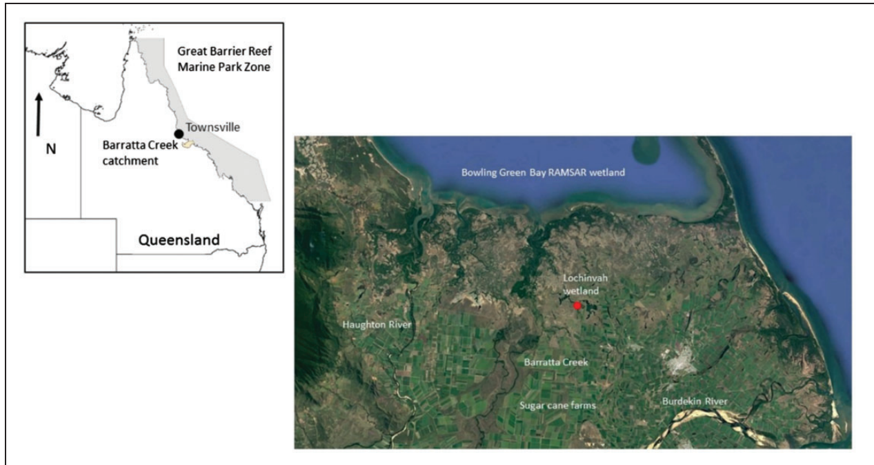
Figure 1. Location map of Barratta wetland, Burdekin River delta, north Queensland, Australia.

critical for floodplain protection (Burrows et al., 2012). In this study, we examine wetland water quality conditions before and after aerial spraying, and in doing so determine the exposure risk to fish, particularly DO conditions and water temperature. This study provides data for managers to evaluate wetland system repair projects in the GBR catchments, but these data have broader relevance given the global infestation of invasive aquatic weeds in coastal wetlands (Villamagna & Murphy, 2010).