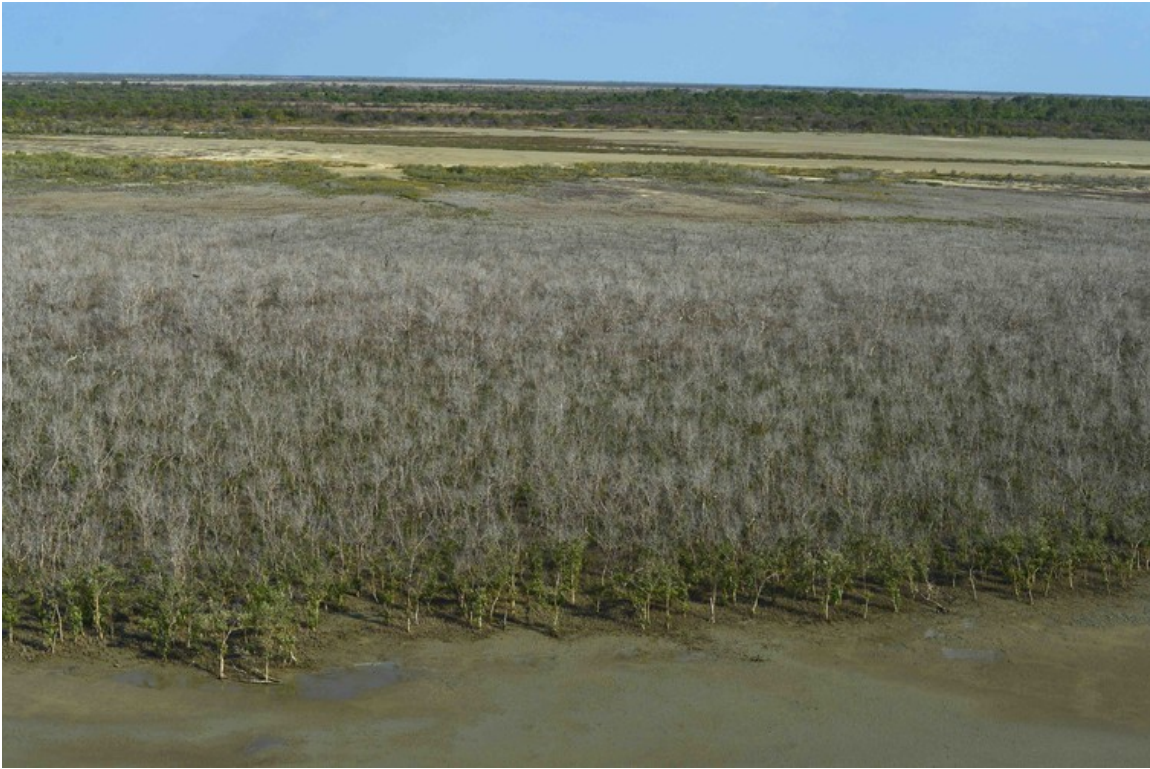
Aerial view of severe mangrove dieback near Karumba in Queensland, October 2016. NC Duke

Now we urgently need to understand how mangroves died at large and smaller scales (such as river catchments), so we can develop strategies to help them adapt to future change.