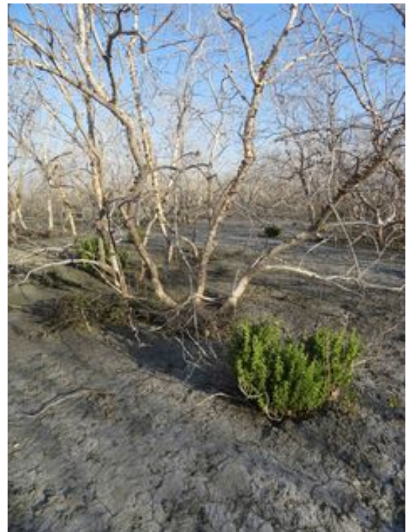
Dieback of mangroves around Karumba in Queensland, with surviving saltmarsh, October 2016. NC Duke

But in early 2016, local tour operators and consultants doing bird surveys alerted authorities to mangroves dying en masse along entire shorelines. They reported skeletonised mangroves over several hundred kilometres, with the trees appearing to have died simultaneously. They sent photos and even tracked down satellite images to confirm their concerns. The NT government supported the first investigative surveys in June 2016.