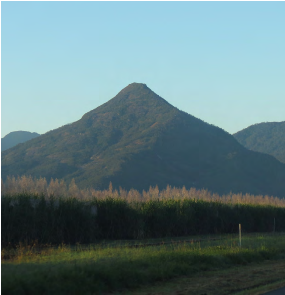
Most of the remaining rainforest within the Australian tropics is to be found on the steepest mountain slopes with the flatter regions long since cleared for agriculture and urban development.

laudable as many of them house some of the poorest citizens in the world. Moreover, the citizens of the world desperately needs tropical roads in particular because the tropics currently house approximately 40 percent of the world's population, and 55 percent of its children under five, but by 2050 it is expected that more than half the world's population and a phenomenal 67 percent of its young children (under five) will reside there! However, if this infrastructure investment is to reach its maximal benefit, it must occur upon a solid base of careful planning. Poorly planned road building could not only impose massive environmental degradation but deliver negligible economic benefits. So the crux of the issue becomes determining how we balance the two competing realities, on one hand, road construction for social development and poverty mitigation, and on the other road exclusion for the conservation of the crowning glory of natural diversity which is housed in the few remaining tropical wilderness areas?