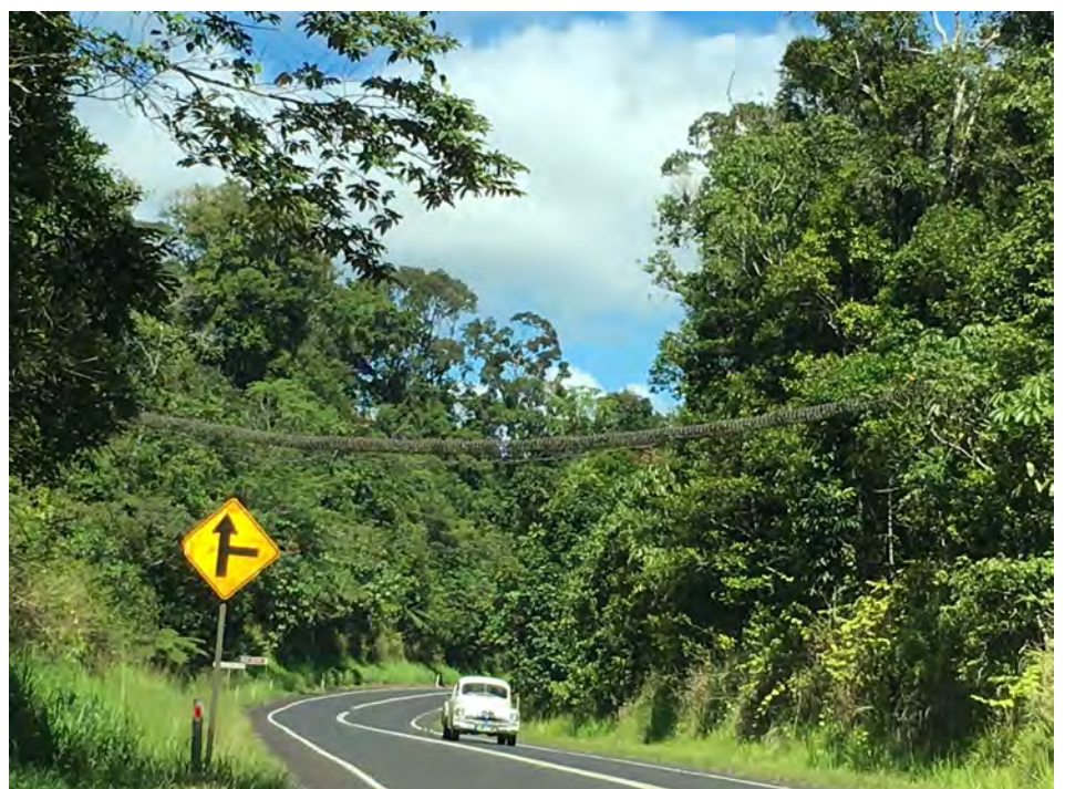
Mitigation measures such as these rope bridges across the Palmerston Highway in tropical far north Queensland, can assist in ameliorating the impacts of tropical roads on arboreal fauna species.