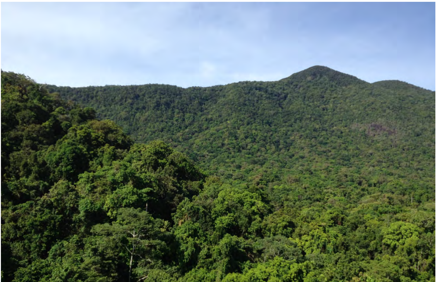
The rainforests of the Daintree are some of the last tropical lowland forests in Australia that have avoided the impacts of an extensive road network.

That's where we come in... Bill's team is leading a major international research effort to devise a strategic and proactive scheme for identifying