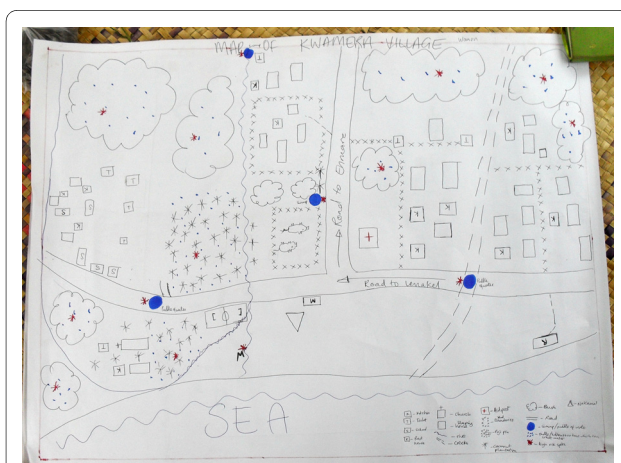
Figure 1 Map drawn by South Tanna women of malaria risk factors in their village.

In such contexts, health education initiatives that attempt to elicit participation only through increasing malaria knowledge and by encouraging individuals to take responsibility for their own health will be ultimately ineffective [19,20]. Mobilising or augmenting social capital has been identified as an important prerequisite to enhancing health promoting behaviours and will be more effective than an approach that emphasizes individual rational choice [10]. Social capital, described as an overarching concept that pulls together previously described phenomena such as 'sense of community,' 'community competence,' 'collective efficacy,' 'critical consciousness,' and 'empowerment,' is thought to be critical for achieving and sustaining community participation in health programmes [10,21]. In Tanna, where existing social mechanisms appear to promote a strong 'sense of community,' and influence individual and household level decision making, complementary strategies should be employed that concurrently augment social capital, improve individual knowledge regarding malaria and its transmission and dispel rumours and misconceptions that can create community resistance to participation in malaria prevention practices. A multi-faceted, multi-level approach will