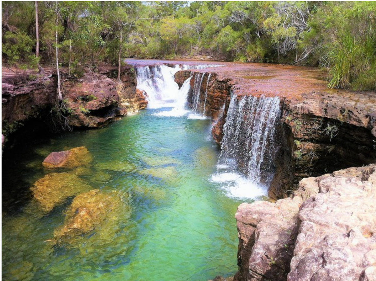
Eliot Falls is a northern Queensland tourist attraction on Cape York Peninsula.

The white paper sets high expectations. It revives the idea that the north can deliver an economic bonanza, along with the old assumption that the north is a bountiful land whose riches have somehow slipped the grasp of the nation.