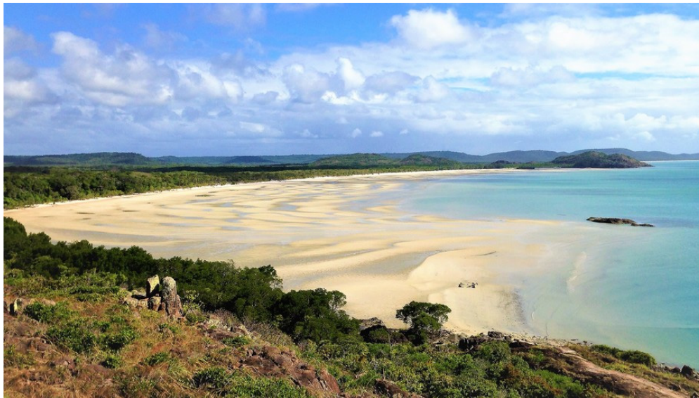
Mainland Australia's northernmost beach.

Adjunct Professor of History, James Cook University