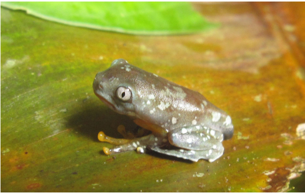
Fig. 3. Newly metamorphosed juvenile Cruziohyala craspedopus .

populations of C. craspedopus , they also appear to be the only way to detect populations within logistical time constraints and with any degree of certainty. The dual advantage of this approach could be widely beneficial to future surveys attempting to find this charismatic and photogenic species.