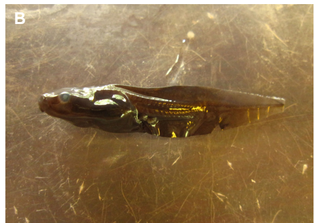
Fig. 2. A) ABHabs P-2.1 with empty egg mass; B) Tadpole of Cruziohyala craspedopus (preserved).