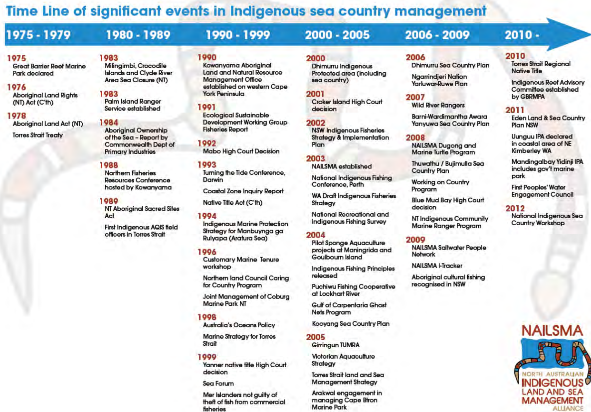
Figure 1: Timeline of significant events in Indigenous sea country management

Since people first started coming together in the mid-1990s, Traditional Owner organisations generally have had very meagre resources to sustain such a campaign at the whole of GBR level. Many groups have needed to focus local efforts on securing their rights and interests in the GBR. However, in the last 15 years, much has changed in the Traditional Owner landscape, and this has renewed the desire for people to revitalise with negotiated approaches from GBR to local scales. These changes have included: