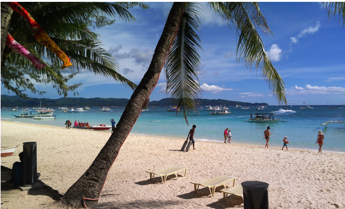
Figure 1: Boracay in Aklan province, a major tourism island in the Philippines (Author's Fieldwork Pictures, July 2013).

The present paper explores the use of political ecology as a framework for analysis in mainstreaming climate change adaptation in islands with significant tourism activity. Political ecology is defined as “combining the concerns of ecology and a broadly defined political economy that encompasses the shifting dialectic between society, land-based resources, and within classes of a given society” (Blaikie & Brookfield, 1987). Political ecology is extensively used to examine the dynamics of place, unequal economic and political power, access to resources, vulnerability of the poor, and nature (Bryant, 1998; Nygren & Rikoon, 2009). Criticism, however, has been levelled at the manner in which political ecology is being used since some assume that political factors are always important (especially external factors) and that special prominence is granted to a priori statements, whereas a more sensible approach would be to look at existing environmental phenomena and work backwards to explain factors, causes, and effects of such events (Vayda & Waters, 1999). We are conscious of this criticism, and the island case study approach pursued here assumes nothing of the sort, instead relying on themes that emerge from application of the methodology.