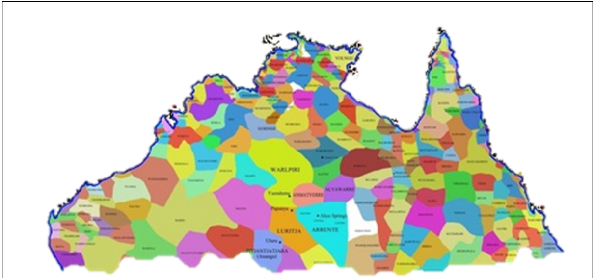
Map 2: Indigenous language areas of Northern Australia. The map demonstrates the approximate range and diversity of language groups in Australia.