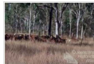
Cattle droving between Laura and 'The Twelve Mile' waterhole, 1982