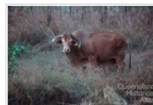
Brahman cattle, introduced in 1933 to northern Australia, Lakefield National Park, 1982