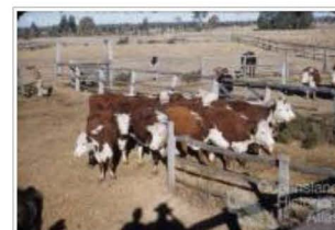
Breeders, Kemsdale Cattle Station (17,000 acres), near Jandowae, 1956