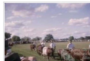
Cattle walk-by at the show, Barcaldine, 1962