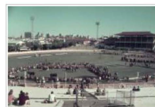
Cattle judging, main arena, Brisbane exhibition, Bowen Hills, c1980s

While cattle breeds seem familiar and dependable, the ability to establish new breeds indicates that breeds are not natural but are constructed by humans. Breeds may have a standard appearance that is distinct and heritable, but breeds are created and maintained by careful human management. Animals are valued according to how well they conform to breed standards and those standards can change, leading livestock breeders to adjust the physical characteristics of their herds. Despite the