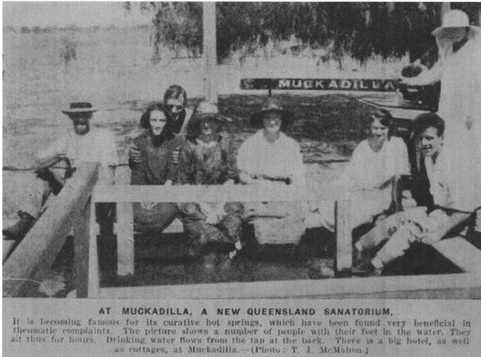
Figure 4 Visitors soaking in the hot artesian waters at Muckadilla, 1924.