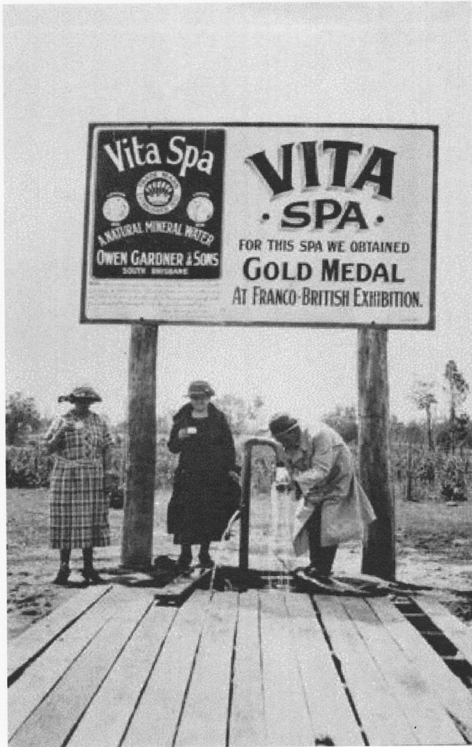
Figure 2 Visitors sampling the water at the Helidon Spa, c. 1918.

shipped to a bottling factory in Townsville, where it was exported to Europe until the outbreak of World War I. 19