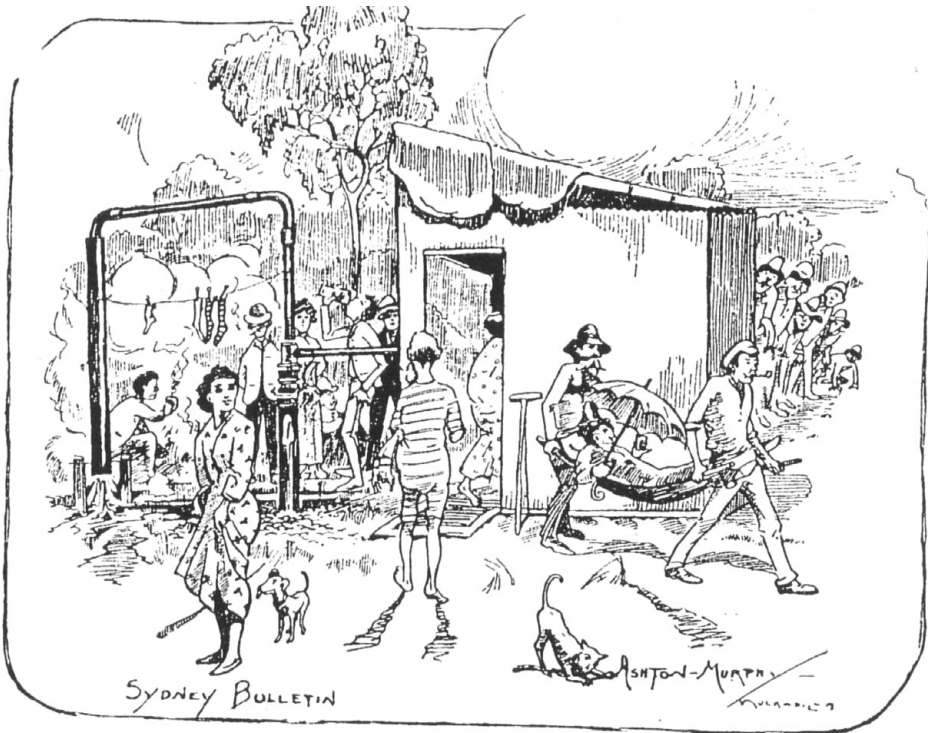
(SYDNEY BULLETIN CARTOON)

Figure 3 A cartoon from the Sydney Bulletin depicting the original bath-house at Muckadilla. Date unknown, but estimated to be c. 1910. The original bath-house was later replaced by a larger complex in 1916.