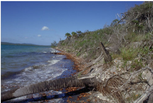
Figure 3. Eroding shell midden in central Queensland.