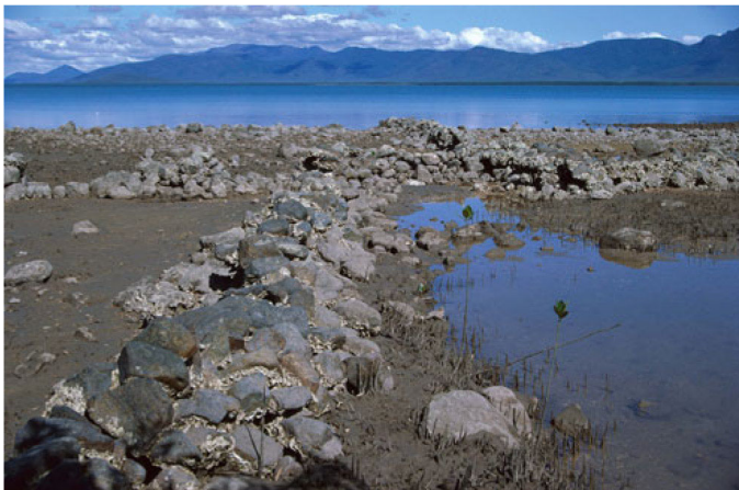
Figure 7. Part of a large fish trap complex on Hinchinbrook Island associated with nearby shell middens