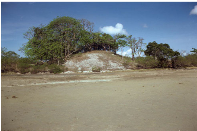
Figure 4. Distinctive shell mound on Cape York Peninsula composed of shellfish, dugong, crocodile, turtle, fish, lizard, bird, mammal and other unidentified bone fragments and a range of stone artefacts.