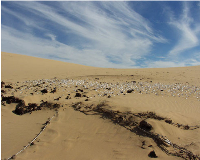
Figure 2. Typical shell midden scatter in central Queensland dominated by Donax deltoides.