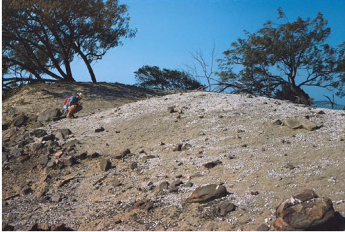
Figure 5. Deflated midden on the Queensland coast on the crest of a sandstone ridge containing predominately oyster shell and a range of stone artefacts.