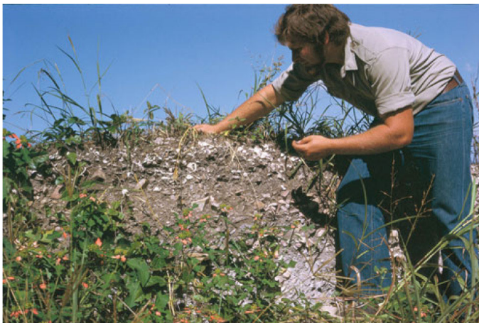
Figure 6. Midden at Booral in southeast Queensland. It contains a range of shell and bone and some glass fragments