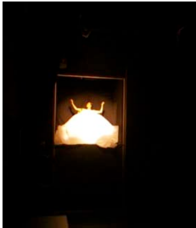
Figure X – Whispering Limbs – Lisa Fa'alafi in Scene 4

Cultural Reveal presents a solo dance performed by Samoan dancer Lisa Fa'alafi. A light illuminates a large white bundle in a second story inset box on the back wall of the performance space, the bundle beginning to move and grow. A snake-like hand slithers upwards, then the head, shoulders and torso are revealed (see Figure X).