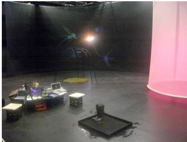
Figure 1 – Whispering Limbs - Main Performance Space

Figure 1 shows the performance area (Cairns' Jute Theatre) from the audience perspective post performance and with general 'worker' lighting rather than theatrical lighting effects. At the lower left the circular table has three areas dedicated to lighting, projection and sound control, the three operators seated on the cushioned crates shown. The dancers utilised the remainder of the space, the water tray and gum boots shown at the lower centre used in a water-based scene titled Water Terrain .