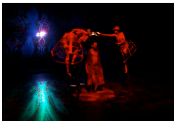
Figure X – Whispering Limbs – Lisa Fa'alafi and Earl Rosas, Leah Shelton and Rebecca Youdell in Scene 12

As shown in Figure X, Rosas places his fishbowl on top of the structure and sets himself centre and beneath the fish. All three girls climb the ladders and almost touch the fish, but are repulsed by it and exit the space. Rosas is left on stage in proximity to the fish.