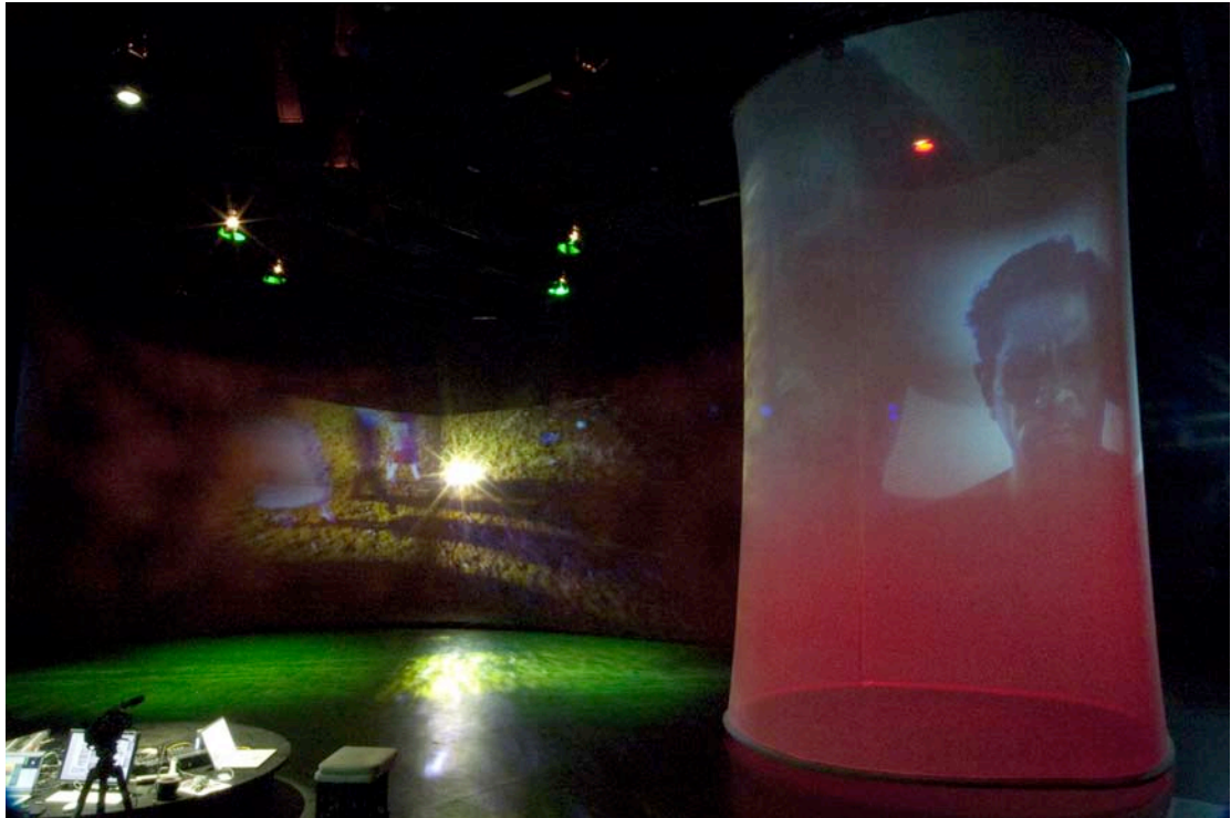
At the rear of the photograph a large black scrim is projected onto by four projectors, whilst the white circular scrim at the right is lit and projected on by two projectors.