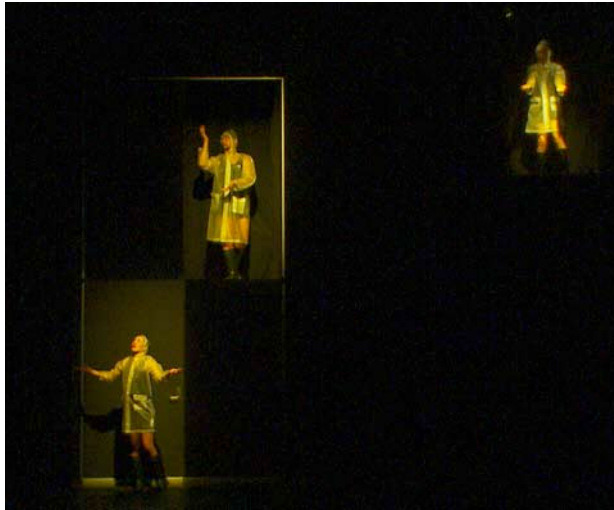
Figure 2 – Whispering Limbs – Rear Wall Box Insets