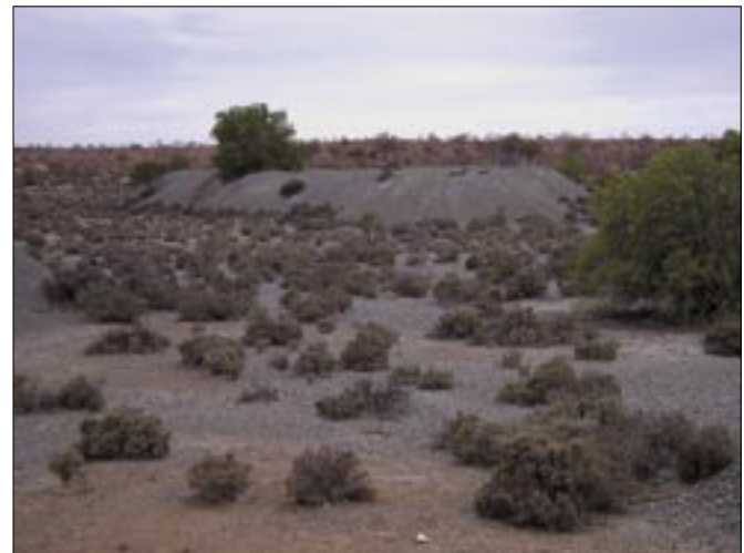
Fig. 3: Crushed waste rock dump (RHCR10: 427 ppm U; 0.48 µSv/h), with eroded waste materials in the surrounding topsoils and surface sediments

Crushed rock material from the mine is found in several dumps in the mine and mill areas. The finer crushed material tends to