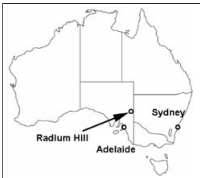
Fig. 1: Location map of the Radium Hill mine site

The Radium Hill mine site is located 440 km NNE of Adelaide, at latitude 32°21'S, longitude 140°38'E, in the Northeast Pastoral Zone of South Australia (Figure 1). The area lies at an altitude of 220 m, with local relief of up to 50 m, but generally the area is undulating with substantial plains. The study area is drained by ephemeral creeks and their tributaries, which in turn flow into the major watercourse of the district, Olary Creek. It is only after heavy rain events that there is surface water flow, but it is evident that these events are the major cause of erosion and sediment transport in the region. Soils are commonly skeletal loams on the hills, but thicken into red duplex and calcareous