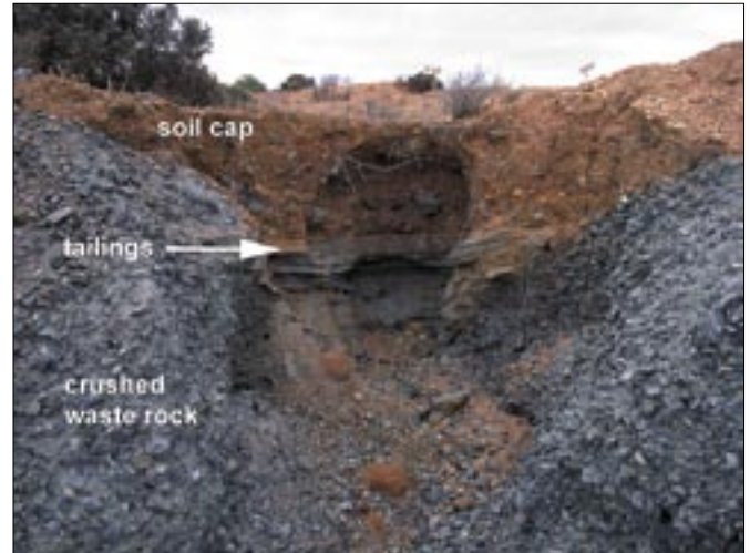
Fig. 4: Erosion and incision into a covered uranium mill tailings repository. The tailings (30.6 mSv/a) were originally (1950s to 1960s) placed into a depression of crushed waste rock and then capped with soil containing calcrete and rock fragments. The soil cover reduces the radiation levels to 0.91 mSv/a as measured at the cover's surface.

Wind and water dispersion of tailings and crushed rock dumps has occurred and remains active at uncovered sites. Prior to covering in the early 1980s, wind deflation was evidently significant about the MTD (Figure 5) and fine tailings material has been dispersed downwind in all directions. Wind-blown tailings material up to tens of centimetres thick is common up to 80 m away on the NE and SE sides of the MTD, but thinner further away and on the NW and SW sides. Small amounts of windblown tailings remain evident for at least 500 m distant on the SE side of the MTD. The dispersion to the NE and SE reflects the direction of the prevailing strong winds, although E of the MTD, the dispersion plume has probably been largely removed by subsequent flooding of a wide stream channel.