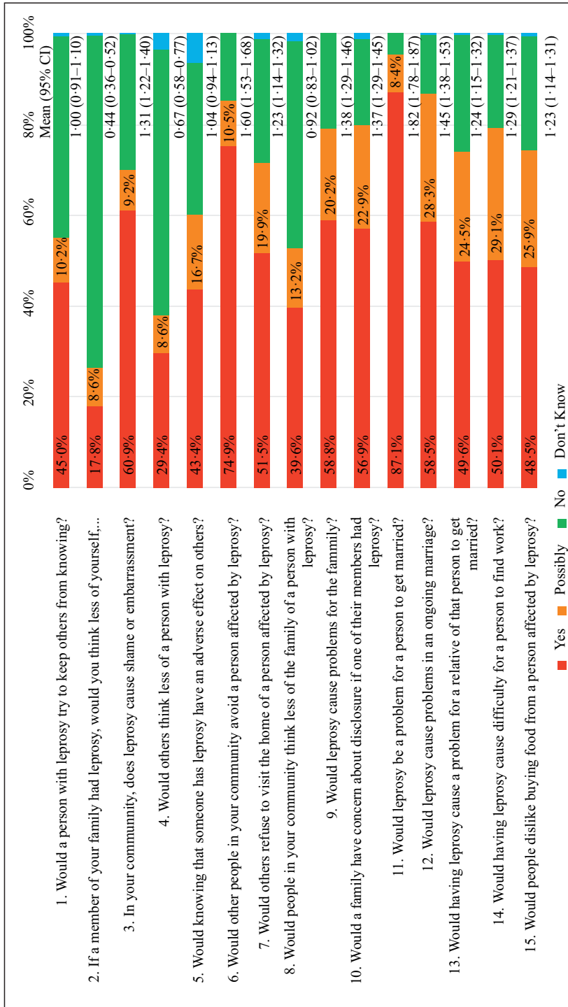
Figure 1. Frequency distribution of responses of community members (n = 371) to EMIC-CSS items. Percentages are provided for the respondents answering 'yes' and 'possibly'. Mean scores and concomitant 95% CIs are provided as well.