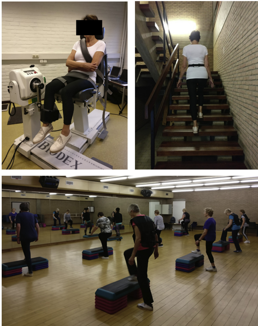
Fig. 1. Setup of the isokinetic dynamometer (top left). The timed stair ascent task with lower back-mounted accelerometer (top right). Impression of a training session in week 10 (bottom).

using a mixed ANOVA design with time as within-subjects factor and group as between-subjects factor. If a significant F -value was found, within-group changes were analyzed using paired samples t -tests. Scores on the motivation questionnaires obtained from the STEEP group were analyzed using a Kendall's W test.