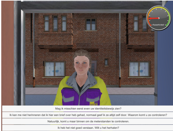
Fig. 2. Screenshot of a choice moment in the application