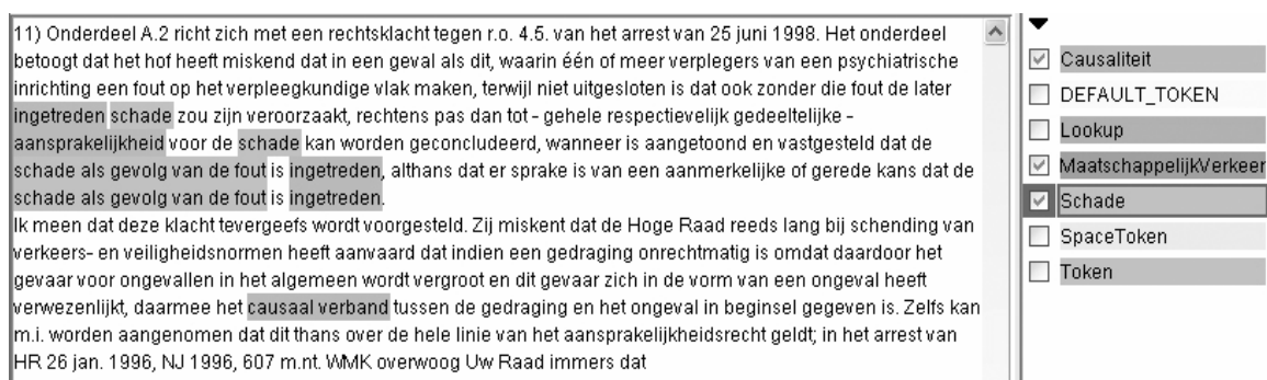
Figure 2. Example of annotation of terms for the concepts 'schade' (damage) and 'causaliteit' (causality).

In the next section we will describe how we process these annotations with