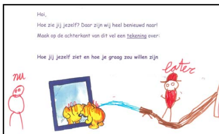
Figure 1: Children were asked: 'How do you see yourself now and what would you like to be like?'

These results show that, despite often mistaken to be unmotivated, participating children and parents start a CBLI mainly because they find the child's weight and related problems an issue. This knowledge helps health care professionals in talking to them about treatment options.