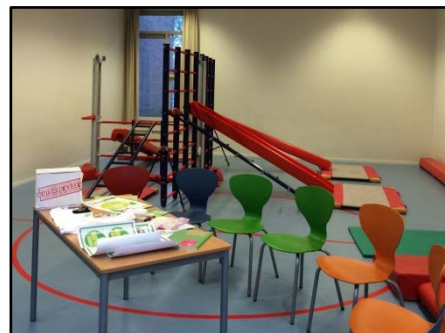
Figure 3: Focus group setting with the 'expectation box' at the table to facilitate discussions.