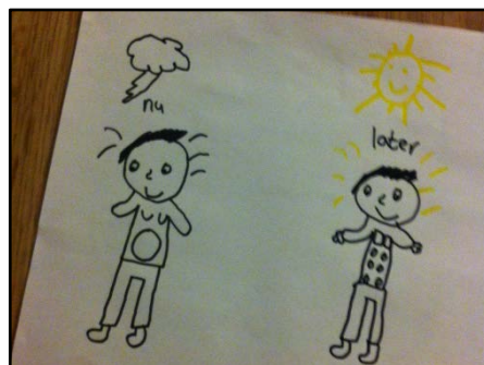
Figure 2: Three typical examples of children drawing themselves thinner in the preferred situation.