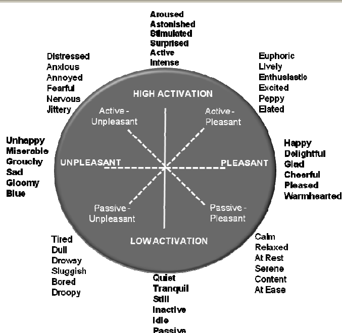
Figure 1: Group mood circumplex (cf. Larsen & Diener, 1992, p. 31)

In this model, moods are arranged circularly with their position depending on their similarity or polarity. This means that two aspects that are close to one another, such as “warmhearted” and “calm”, are highly correlated. The various group moods are classified on two orthogonal or independent dimensions: (1) behavior willingness or activation (high – low activation) and (2) hedonistic value (pleasant – unpleasant).