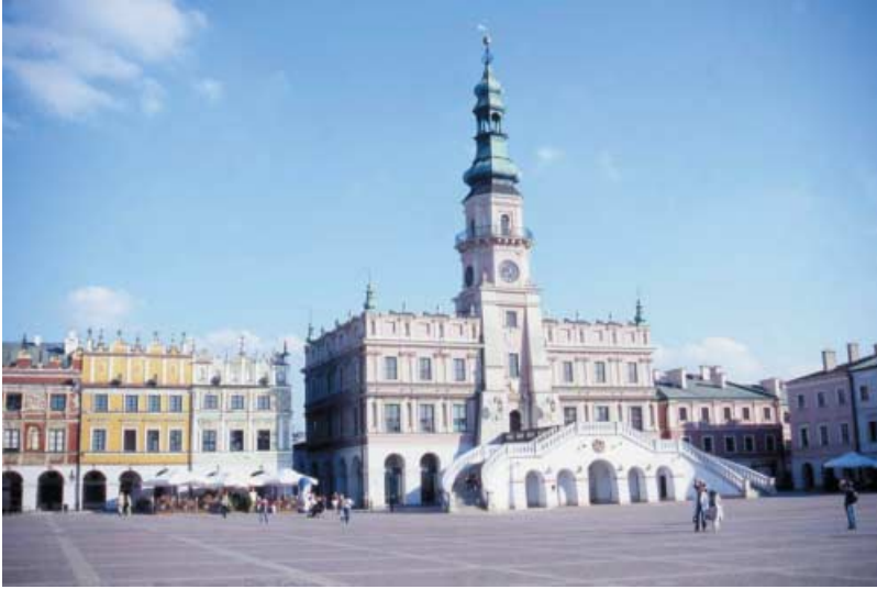
Figure 2. Zamosc, pictured in 1992.

connected to the amalgamation of the European Union. The recent designation or proposal of a number of transnational sites, such as the Roman frontier fortifications, the Franco-Belgian belfries and the Struve Geodetic Arc (a chain of nineteenth century survey triangulations stretching from Hammerfest in Norway to the Black Sea, through ten countries and over 2,820 km) show this tendency.