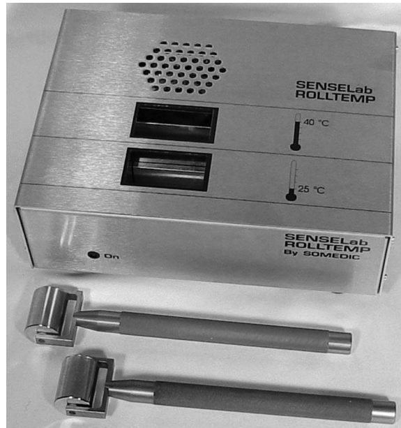
Fig. 1. Rolltemp with base unit, warm roller (upper) and cold roller (lower). Somedic AB, Hörby, Sweden. Permission for use obtained by Somedic AB.

continuous variable was used for the total of correct answers (ranging from 0 to 6), while a dichotomous variable was used for the number of participants who obtained the maximum score of 6 (=1) and those who did not (=0).