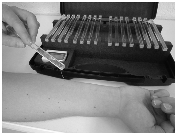
Fig. 7. Use of the Von Frey monofilament on the volar aspect of the forearm.

For the first research question, Chi-squared tests were used to associate group with optimal sensory test performance and Mann–Whitney U tests were used to compare groups on sensory test performance. For the second research question, sensory test performance was related to possible dementia indication with Mann–Whitney U tests, was related to intellectual disability level with a Kruskal–Wallis omnibus test, and was related to intelligence level with Spearman correlations. In