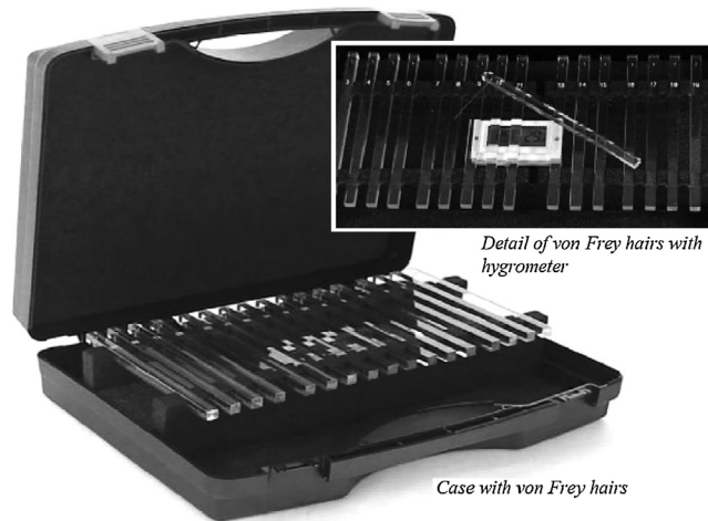
Fig. 6. Von Frey monofilaments of the Aesthesiometer. Somedic AB, Hörby, Sweden. Permission for use obtained by Somedic AB.