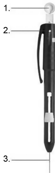
Fig. 3. Neurotip with location of the Neurotip (1), the spring mechanism to exert a force of 40 g (2), and the monofilament (3). Owen Mumford Ltd, Oxford, United Kingdom.

Permission for use obtained by Owen Mumford Ltd.