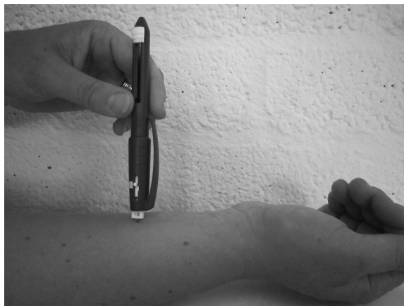
Fig. 4. Use of the Neurotip (sharp side) on the volar aspect of the forearm (photo made by the researchers).

Statistical analyses were performed using IBM SPSS Statistics 21. The level of statistical significance (two-sided) was set at \alpha = .05 , but was .017 for analyses in which the three sensory functions were included (Bonferroni). Age in the control group and all variables of the spinothalamic-mediated sensory tests were not normally distributed (using skewness and kurtosis). The assumptions for linear regression analysis were violated (Field, 2009). It was impossible to form one component of spinothalamic-mediated sensory function (using Principal Component Analysis and reliability analysis). Estimated intelligence level was missing in 15 (8%) DS participants, because the subtests were not yet included in the study protocol of 10 participants and comprehension of the subtests was insufficient in 5 participants.