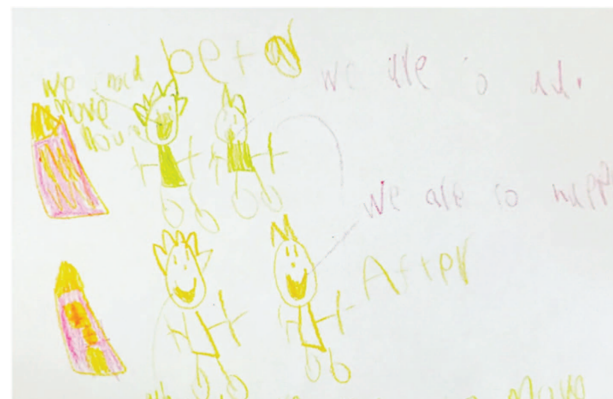
Figure 3 A picture showing the child's family before and after the intervention. In the before picture, the child has written by an image of his home 'we are so sad' and in the after picture the child has written 'we are so happy'.

perceived that being exposed to families with children affected by life-limiting conditions would upset their children.