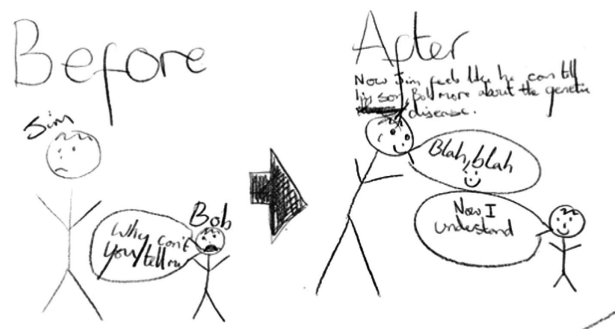
Figure 2 A picture showing a family before and after attending the MFDG intervention. In the before image the child is sad and confused asking their parent "why can't you tell me?" In the after picture the child is happier because he understands what is happening in his family because his parents have been 'able to tell his son a bit more about the genetic disease'.

Logistical challenges such as travel costs and/or child care costs were also seen as a barrier for some families' participation. The most prevalent barrier to attending the MFDG however were parents' anxieties surrounding children's exposure to other IGCs. Parents