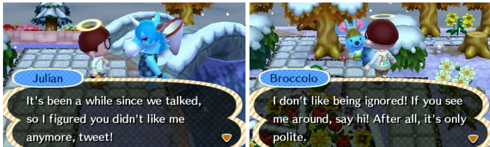
Figure 8: Examples of introductory dialogues with villagers after longer periods of not playing the game.

The other Heideggerian concepts of ambiguous states of being and living (Heidegger 2000) primarily emerge as a result of the game progressing by "playing itself" without any exertion of agency from the player. This player independent progress is expressed partly in the state of the village itself where flowers wilt, seasons change, and weeds grow as time moves forward. But, the passage of time is also felt emotionally by the villagers themselves. If longer periods of time are allowed to pass between player-NPC interactions, the NPC will initiate the dialogue by stating exactly how many days, weeks, or months it has been since their last chat or that they have been saddened or upset by the player's absence (see Figure 8).