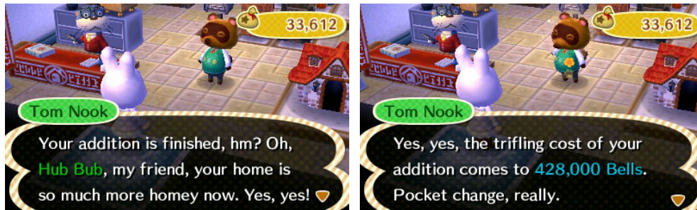
Figure 6: Left: encouraging dialogue after renovations are complete. Right: the ‘trifling’ cost of renovation work.

In the above screenshots, the player is coaxed into accepting continued and added debt by buying into the idea that larger homes are more ‘homey’. The dialogue presented by Tom Nook (see Figure 6) particularly serves to highlight the uncanny play on adult anxieties. The NPCs tell players to always strive for a larger house, and also continuously encourages them to remain indebted by almost never describing their house as being good enough. The NPCs’ desire and admiration for space and symbolic wealth, combined with the loans involved in house expansions since they cannot be made in cash beforehand and only in credit afterwards, evokes anxiety and create a sense of ineffectualness simultaneously. The goals successful adults are meant to achieve, such as being debt-free homeowners, are always just out of reach.