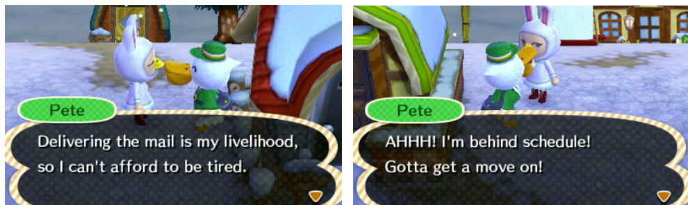
Figure 5: Stressed conversations with the mail deliverer.

Adult anxieties, such as the stress evoked by the desire to be successful and accepted by peers, are also invoked through further NPC interactions. While many of the NPCs do not have defined roles or occupations, the few who do often comment on the stress and anxiety their work entails. One example of such an NPC is Pete, a pelican postman the players can occasionally encounter in the village early in the morning. After an initial friendly greeting, Pete will refuse continued interactions on account of being too busy for chatter (see Figure 5).