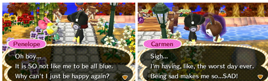
Figure 2: Examples of interactions with sad NPCs, both interactions begin and end with the dialogue windows shown. The two NPCs made each other sad by getting into an argument that the player had no part in instigating or directing, and they are both inconsolable afterwards.

Other examples of agency limitations are the more rare instances when your villagers refuse to let you interact with them. This primarily occurs when the villagers are sad or angry, which can happen either as a result of an argument with another villager, or as a result of the player acting improperly or abusing them. Once a villager is made sad or angry, the player will not have any means of interaction that can cheer them up and make them talkative again (see Figure 2).