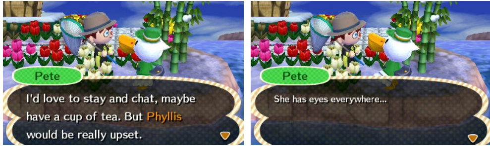
Figure 7: Example of a reference made by one NPC to the disembodied awareness of other NPCs in the game.

Some NPCs in the game occasionally make, presumably inadvertent, references to this trait of the game's AI in interactions with the player (see Figure 7). The length the game goes to in order to present a coherent and pleasant game world with natural and 'embodied' characters makes these types of moments stand out.