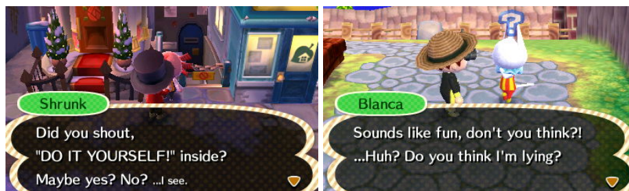
Figure 1: An example of an NPC attributing negative attitudes to the player in dialogue.

The more superficial type of agency restriction encountered in the game is the very limited amount of options the player has to control their interactions with other characters – the most common choice the player gets is simply to “prompt continued conversation” or to “say goodbye”. Even in very rudimentary dialogues, where the player has no agency beyond starting the conversation, NPC interactions often take a tone that can be read as unsettling. NPCs will occasionally berate the player, presume that he or she is angry, distrustful or tired, or has malicious intent in talking to them (see Figure 1).