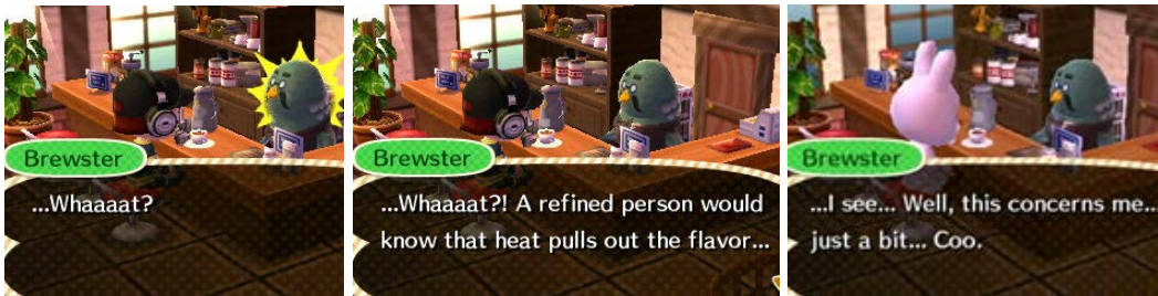
Figure 3: Brewster reacting to players wanting to wait for the coffee to cool.

The game contains another type of agency limitation as well: the one of presenting fake choices during interactions. A specific example of this can be found in interactions with one of the game's store owners: the pigeon barista, Brewster, in the village's coffee shop. The player can, once per day, order a cup of coffee from Brewster. Upon receiving the cup of coffee, the player is given two dialogue choices: immediately drink the coffee, or let it cool off a bit. The second choice, however, only leads to a dialogue where Brewster becomes upset and lectures or insults the player for not knowing how to drink coffee properly (see Figure 3). This dialogue is repeated infinitely if the second choice is chosen multiple times. Brewster's slightly overzealous reaction to the seemingly innocuous choice of letting your coffee cool down is another example of blind agency, but it is also one of agency limitation. The player is seemingly given options, but only one will allow them to further the interaction and they are trapped in an infinite loop of dialogue until they acquiesce and chug a cup of scalding hot coffee (as graphically represented by steam rising from the cup).