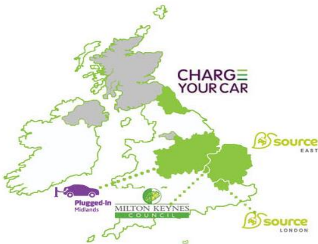
Fig.3: EV public charging networks in UK

Other parameter that was considered for the study is the amount of parking permit fee paid by the students and staff annually at the universities where there is parking facility. Staff at universities pays the parking fee according to their salary (0.3% of the salary of the staff member at Brunel University). Parking permit fee paid by staff who earns £25k per annum at HEI’s are considered in this research. Fig.4 shows the graphical representation of student staff annual parking permit fee paid. Although parking fee is charged there is no guarantee of parking space and the process of hunting is required. This drawback gave scope for incentivising (concession in parking permit fee) EV users which in turn makes others motivated to use EV